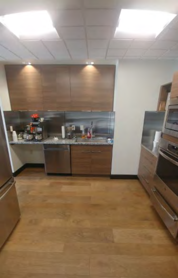
Kitchen with Hot & Cold Beverage Bar