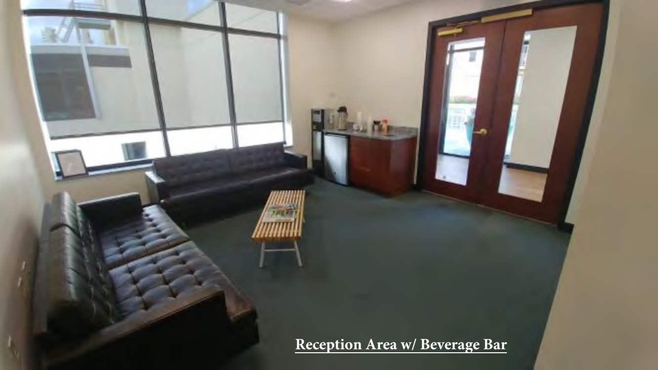
Reception Area w/ Beverage Bar