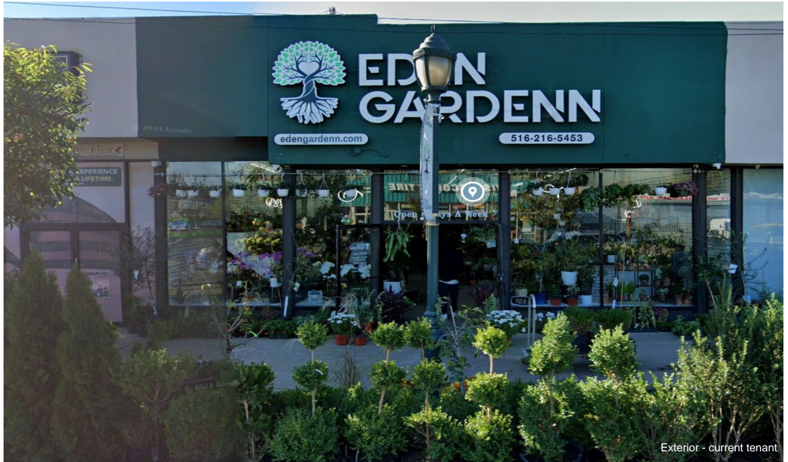
Exterior - current tenant