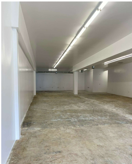
2414 Jefferson St Interior