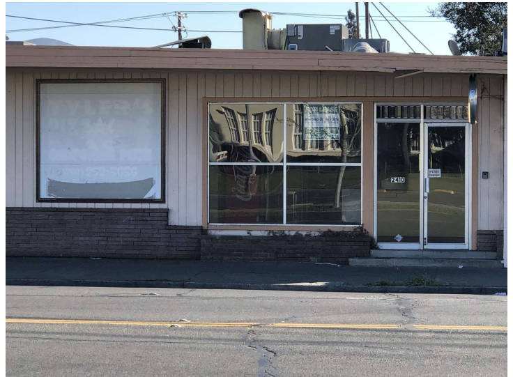
2410 Jefferson St Exterior