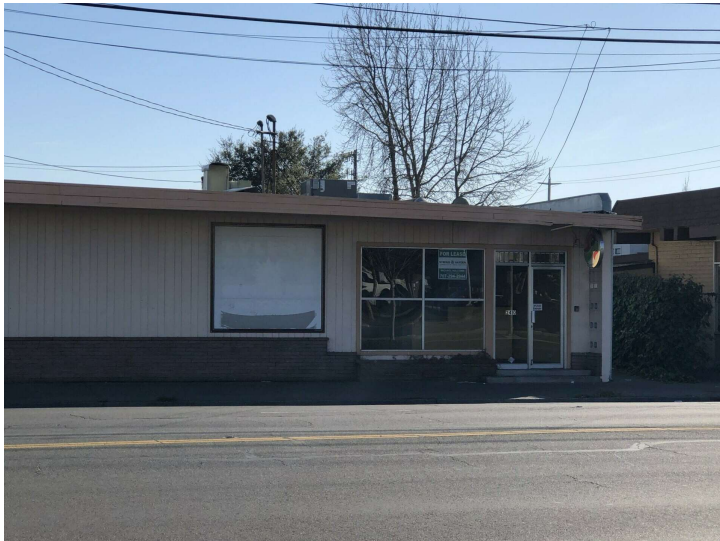
2410 Jefferson St Exterior