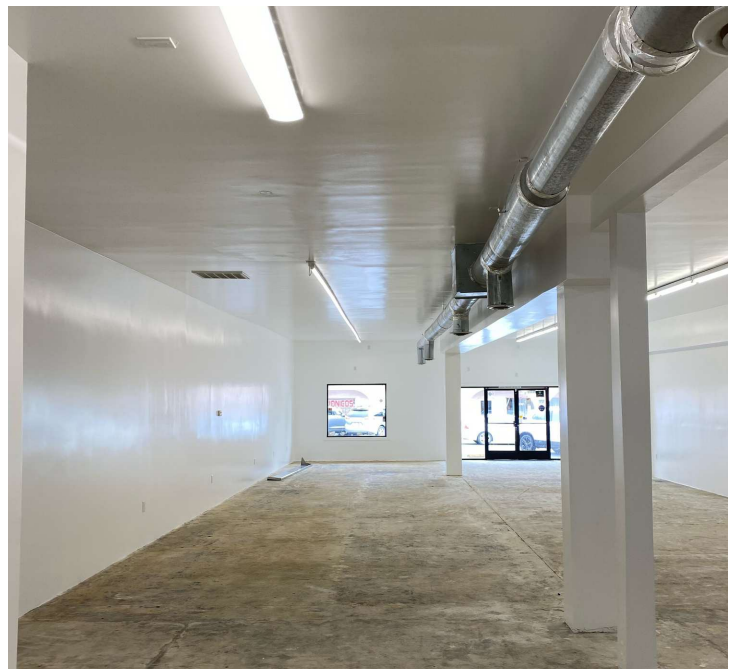
2414 Jefferson St Interior