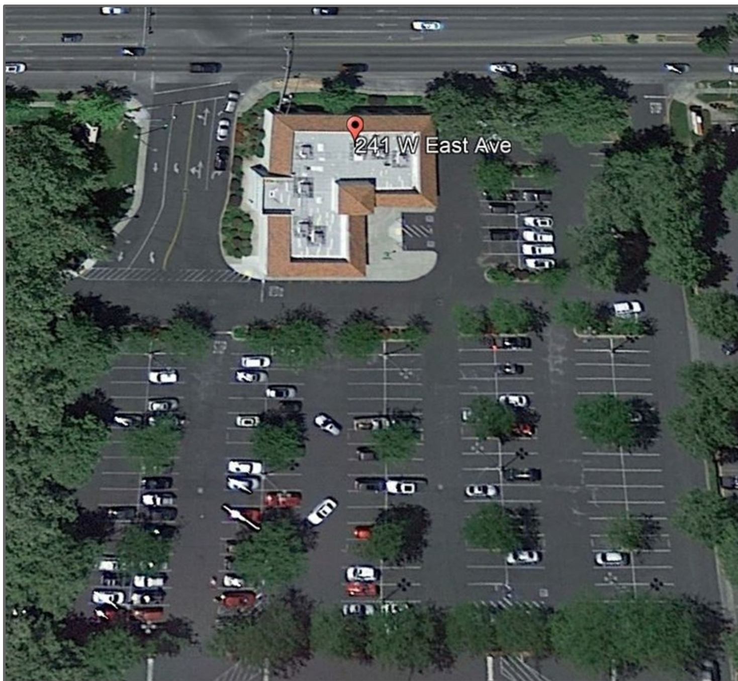
Aerial Site Map