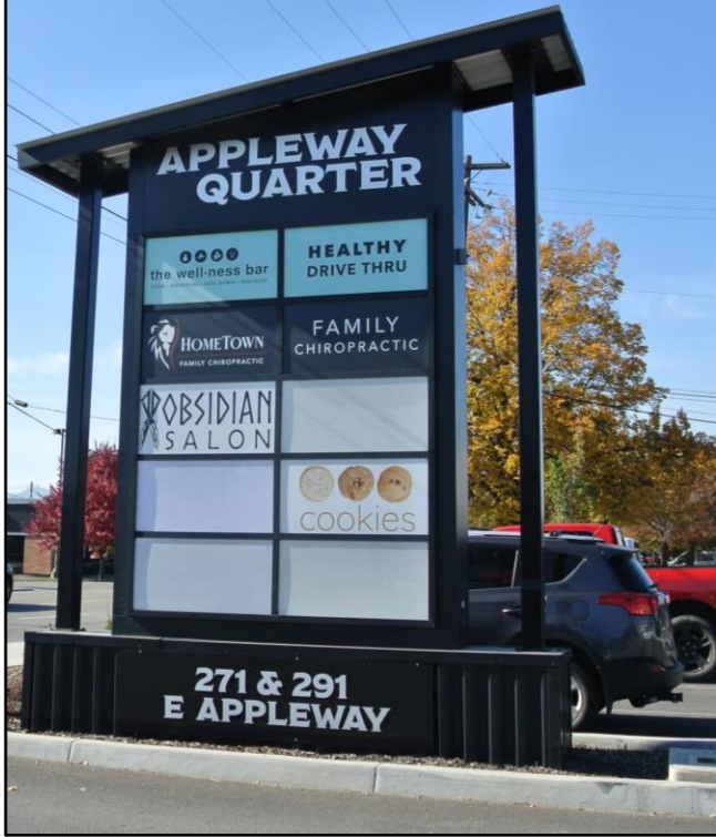
Pylon signage available

293 E Appleway Avenue Coeur d'Alene, ID 83815