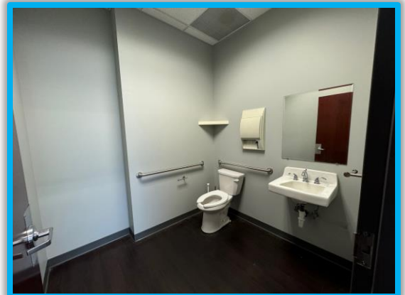
NW Prairie View