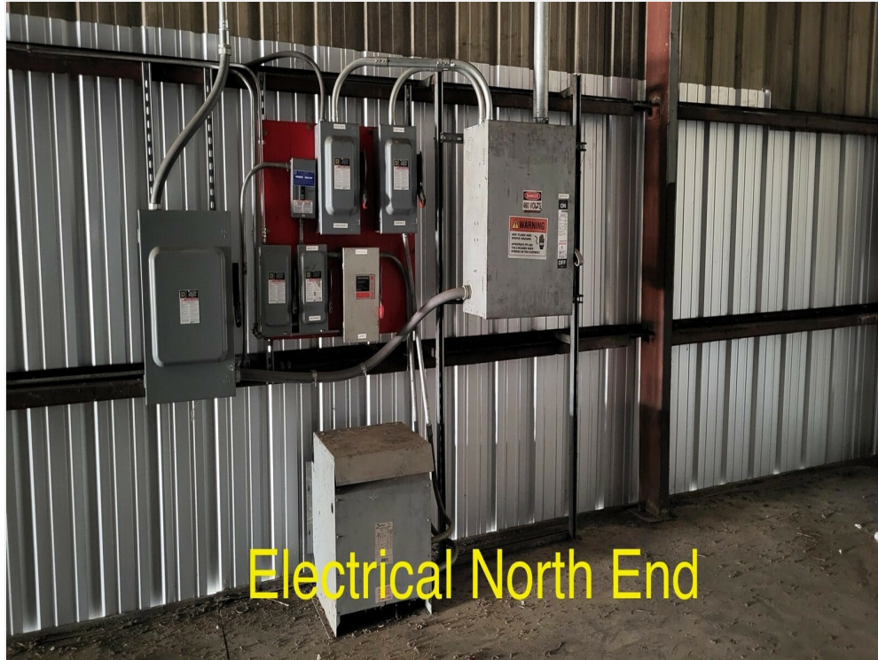
Electrical North End