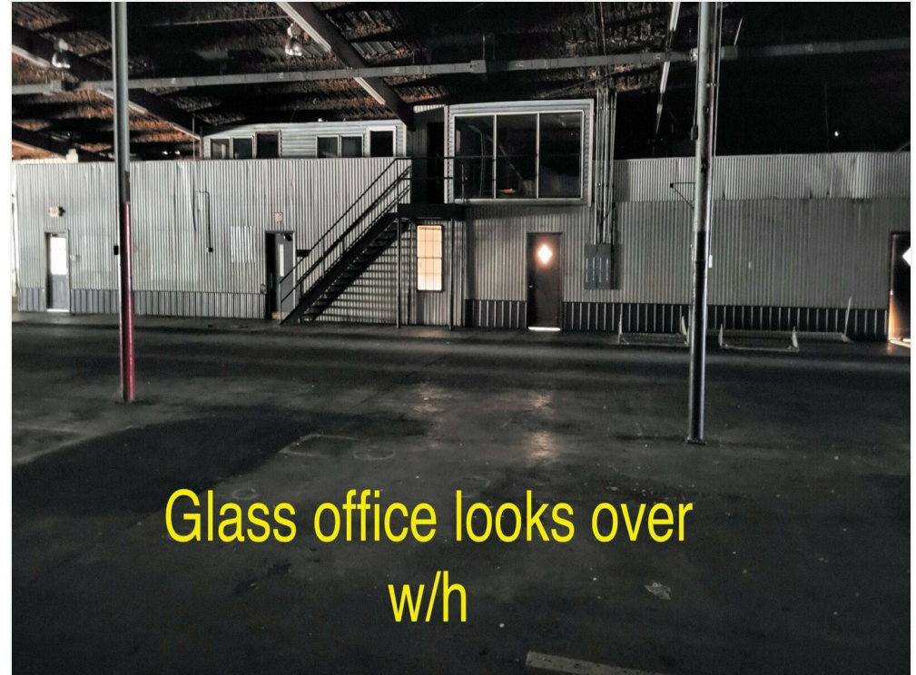
Glass office looks over w/h