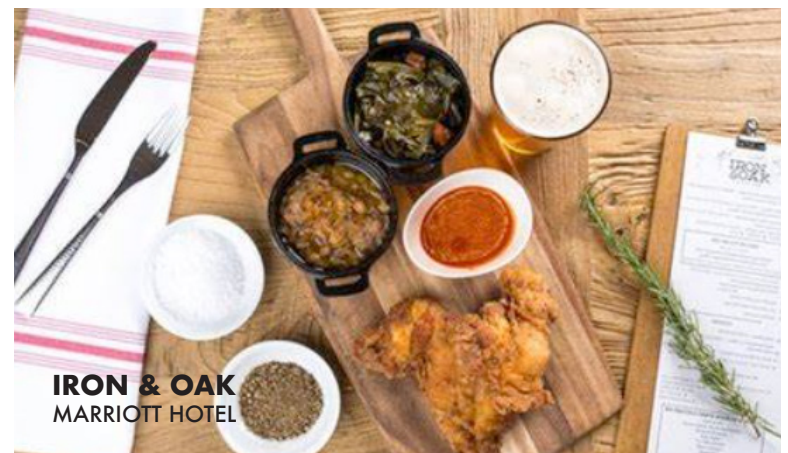
IRON & OAK MARRIOTT HOTEL