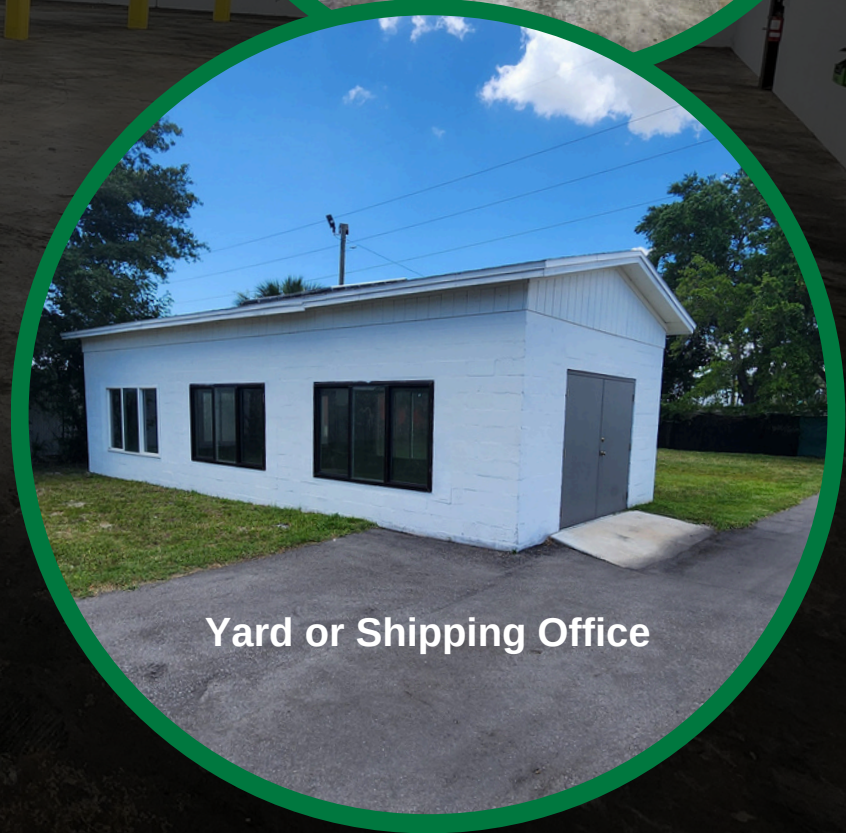
Yard or Shipping Office