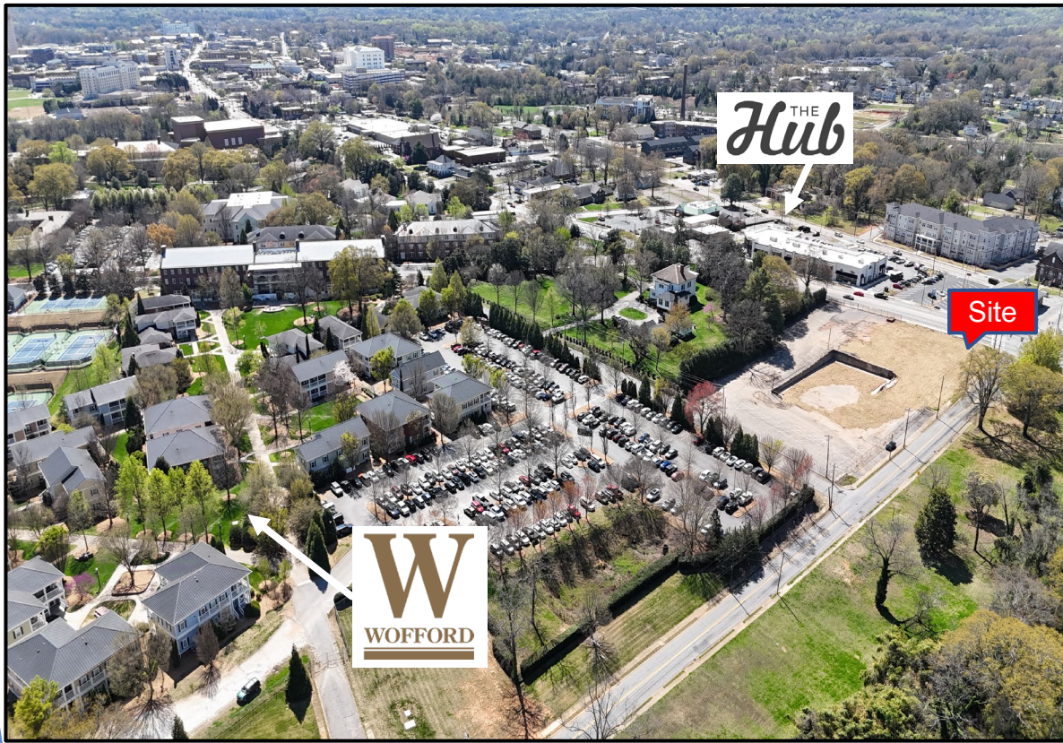
Facing The Hub towards Downtown