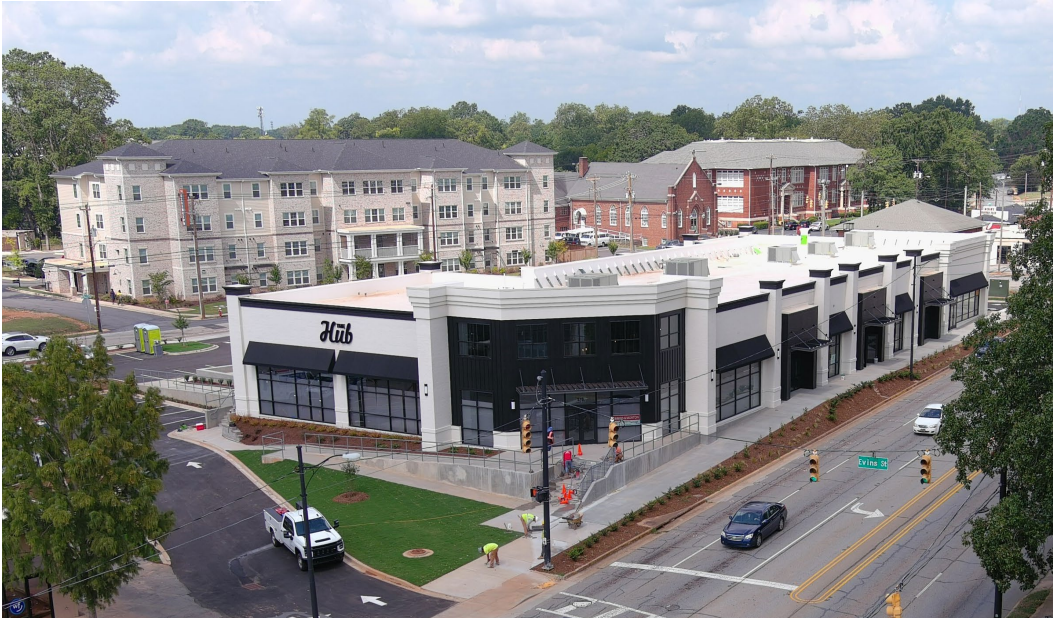
16,699 SF Class A Retail (delivered 2023)