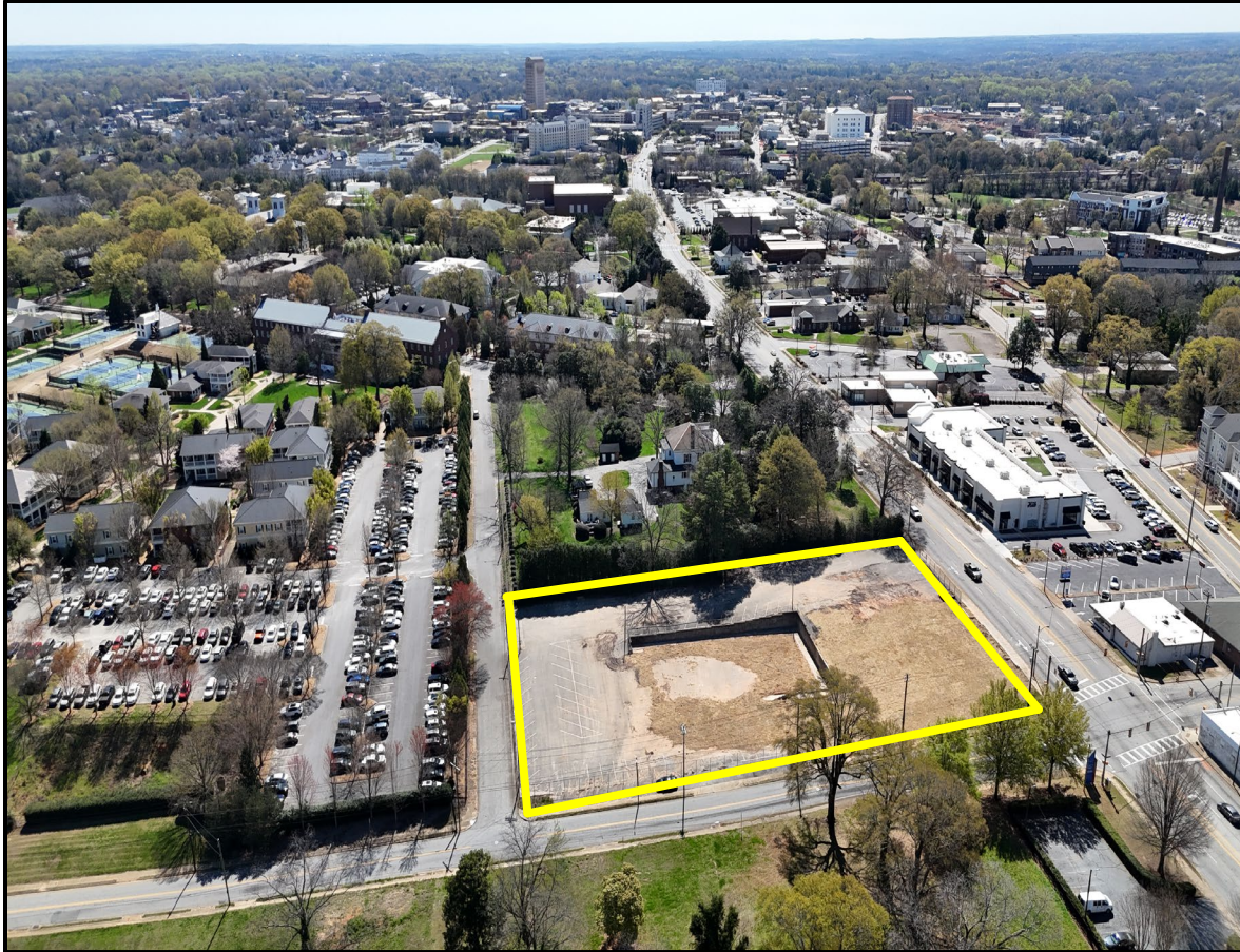
Facing South to Downtown