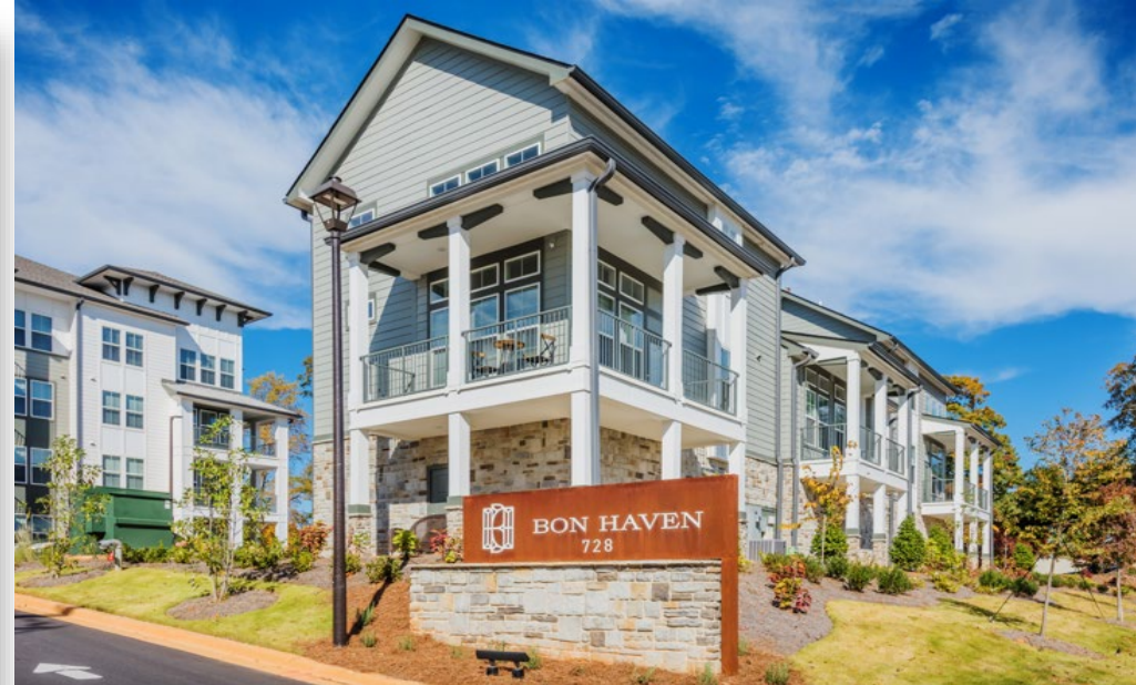
158 Market-rate Apartments (delivered Fall 2021)

Every effort has been made to ensure the accuracy of the information contained herein, however the data and information provided should be independently verified.