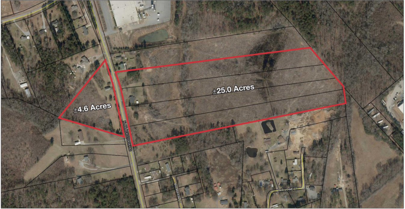
* All dimensions are approximate and have not been verified.