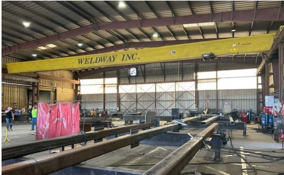
Interior Showing 5 Ton Crane