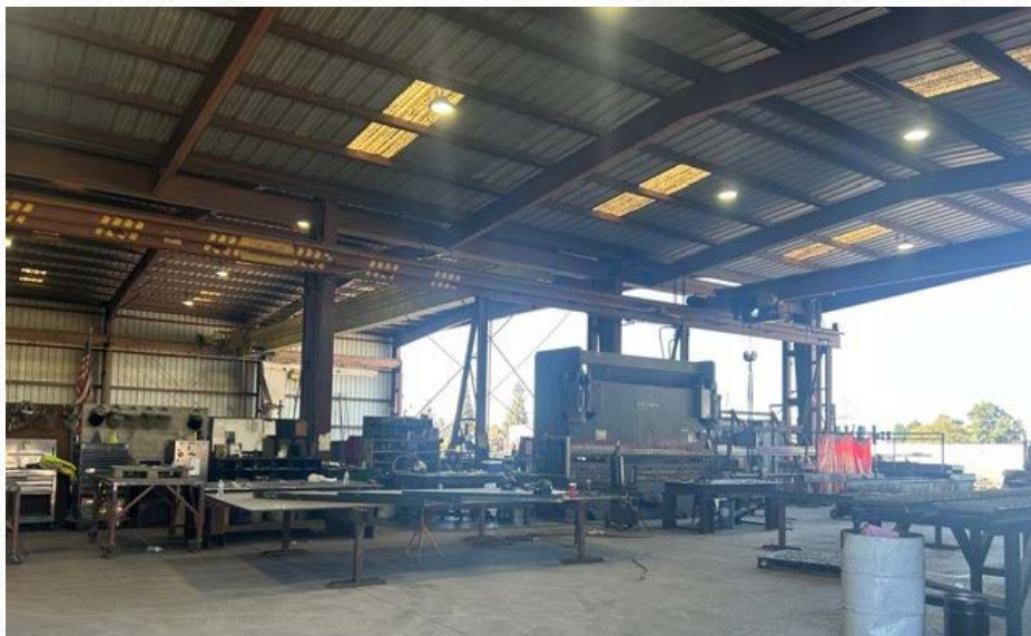
Interior of Main Building