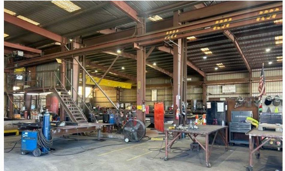
Interior Showing Columns