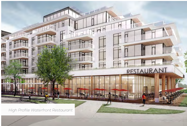
High Profile Waterfront Restaurant