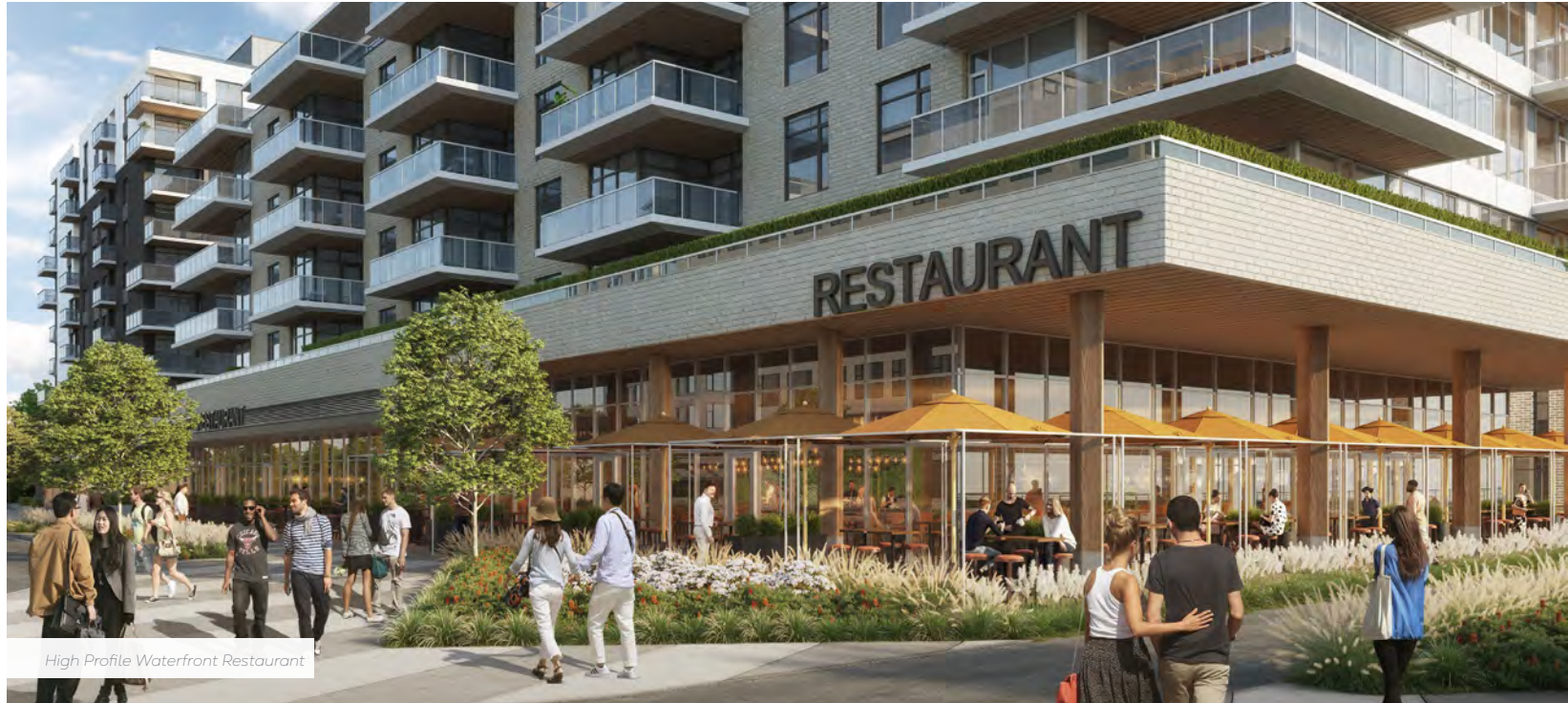
High Profile Waterfront Restaurant