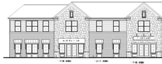
1 Building 9 - Front Elevation