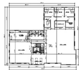
2 Building 9 - Second Floor