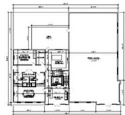
1 Building 9 - Ground Floor