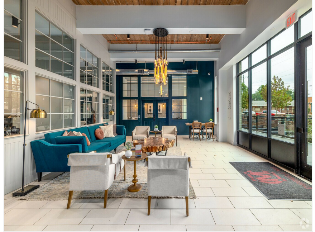
Community Space Chronicle Mill