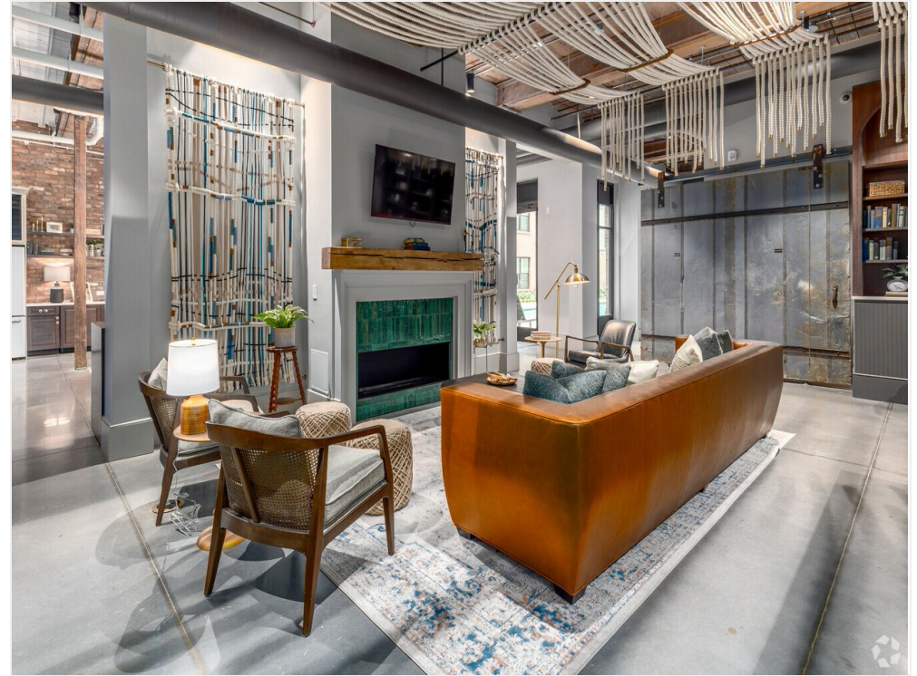
Community Space Chronicle Mill