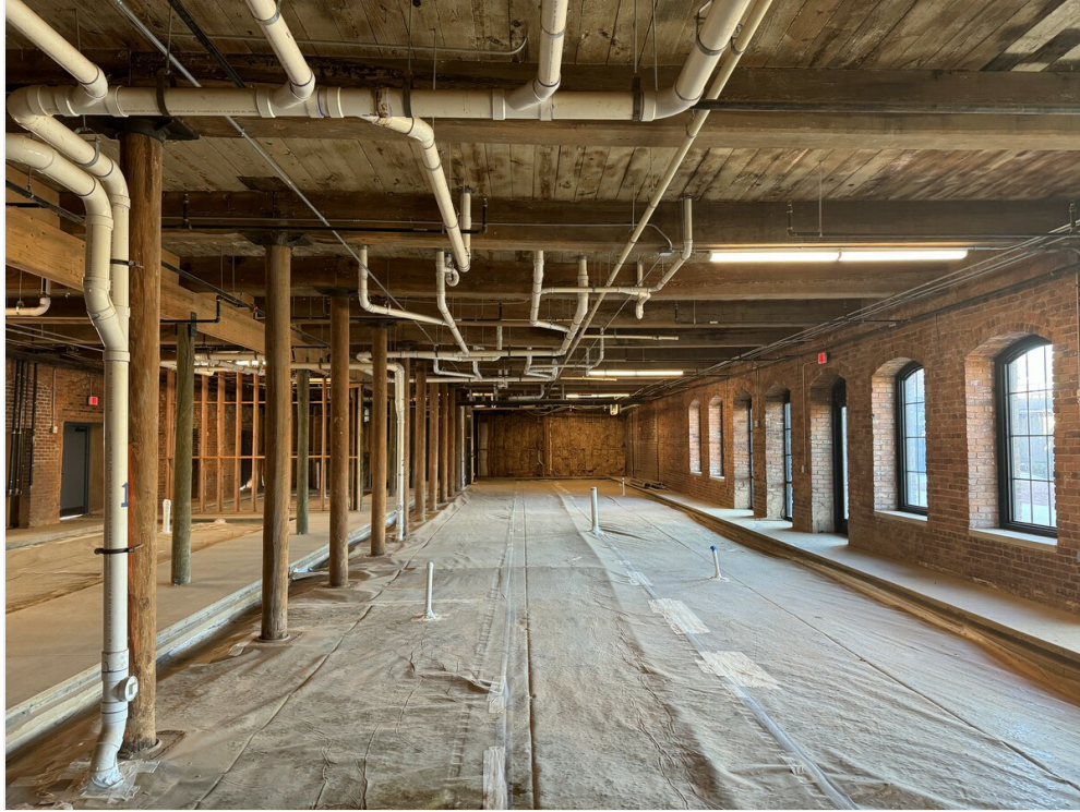
Large Retail Space 6,315sf