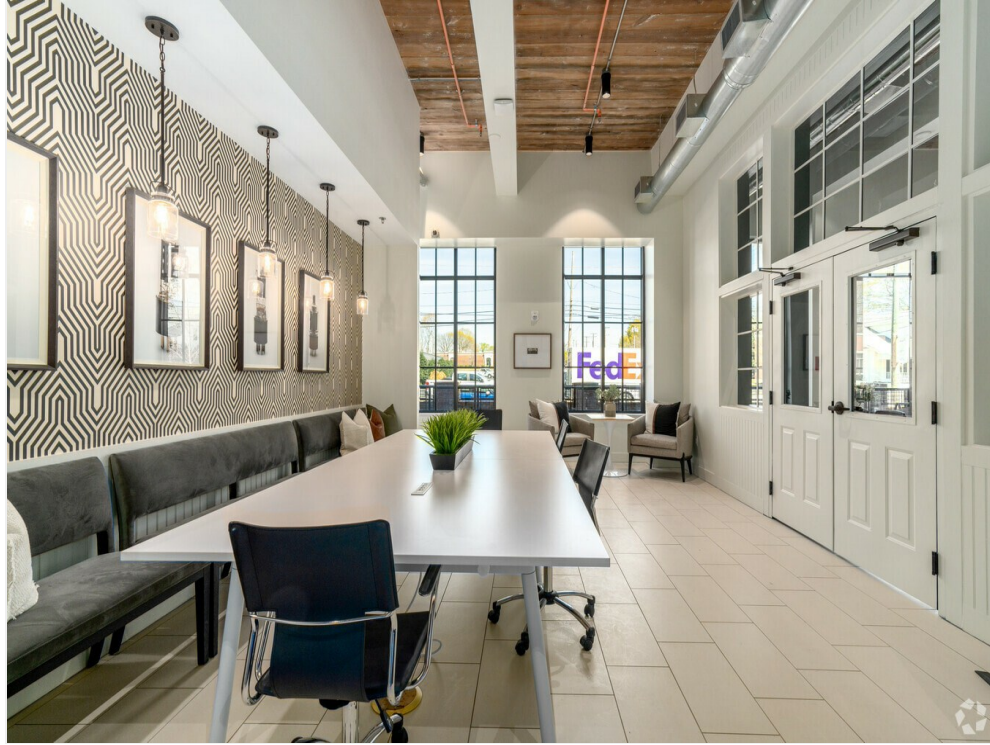
CoWorking Space Chronicle Mill