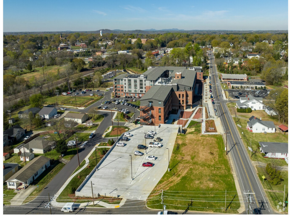
Chronicle Mill Aerial