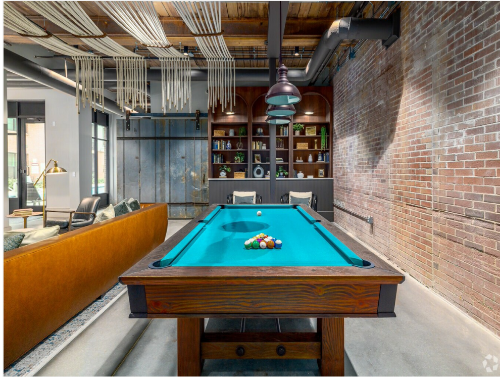
Community Space Chronicle Mill