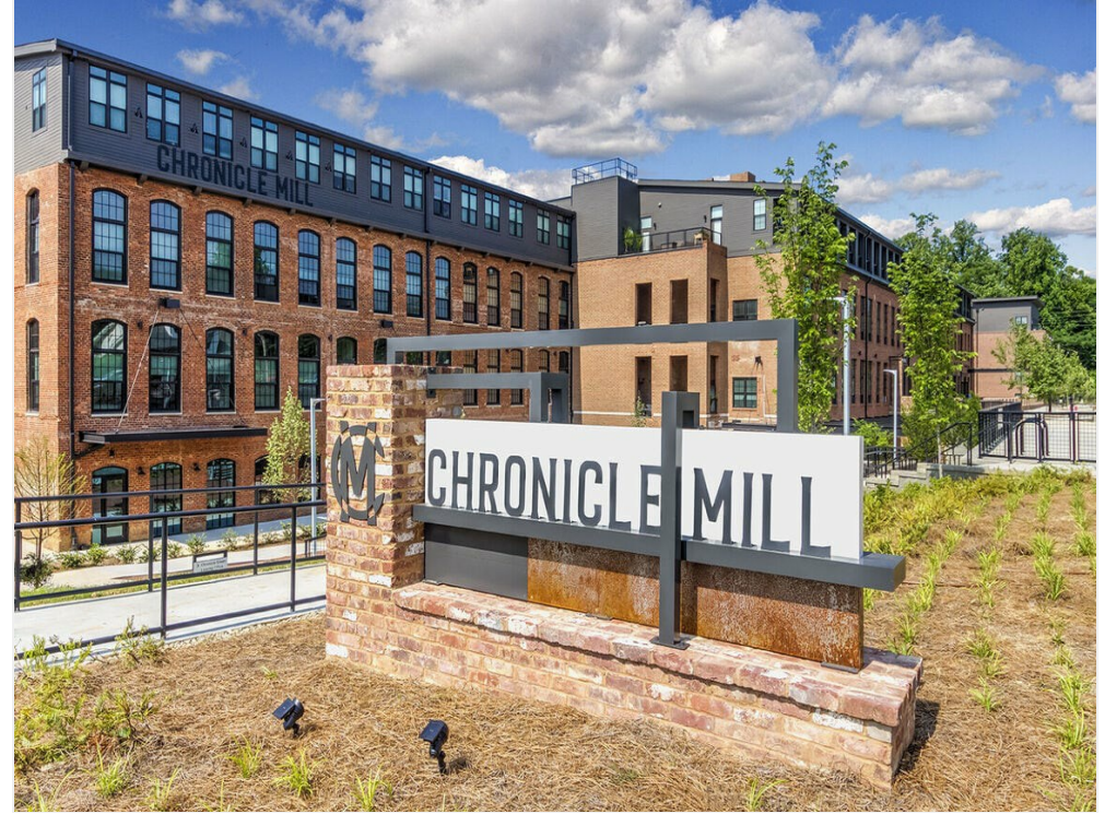
Chronicle Mill Catawba St view