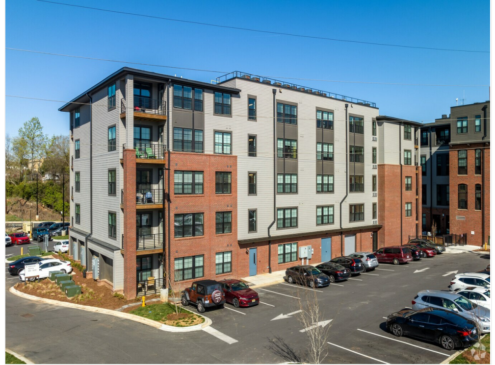
Rear View Chronicle Mill