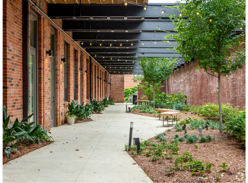
Walkway to Chronicle Green