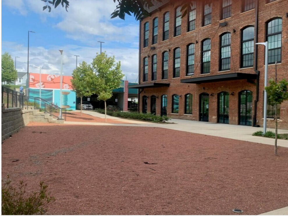
Chronicle Green Retail entrance