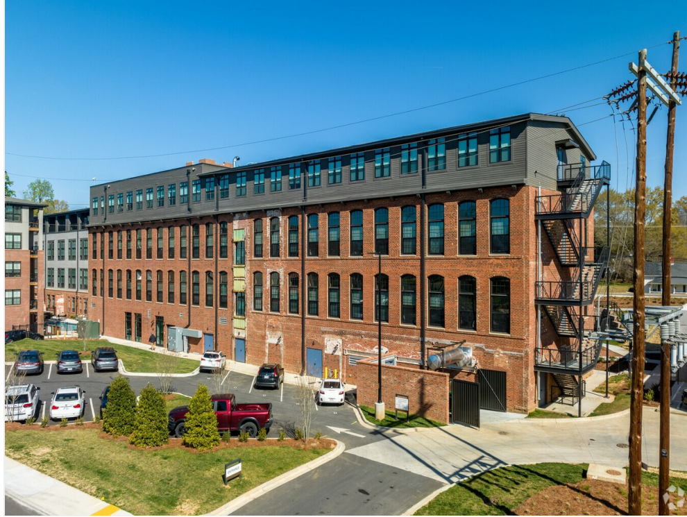
Rear View Chronicle Mill