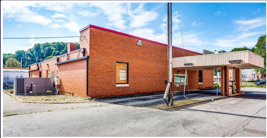
40 MAIN STREET, BOONES MILL VIRGINIA