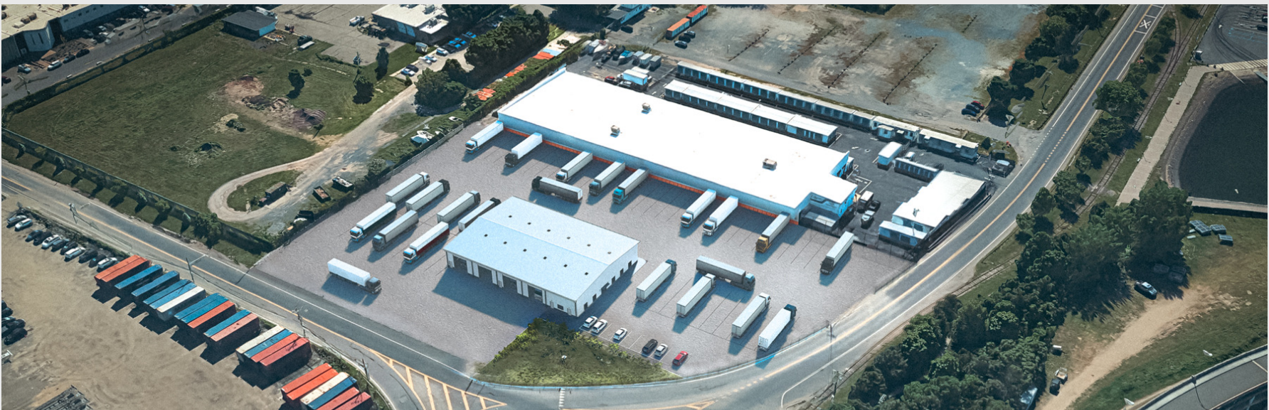
Proposed rendering – 4 drive-thru bay maintenance facility