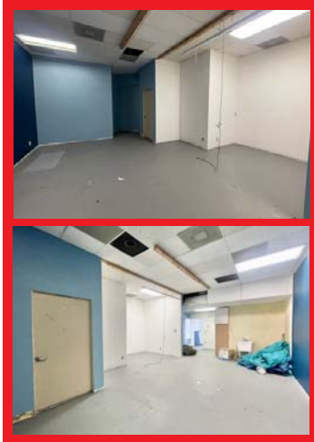
Suite 746 - Interior Photos