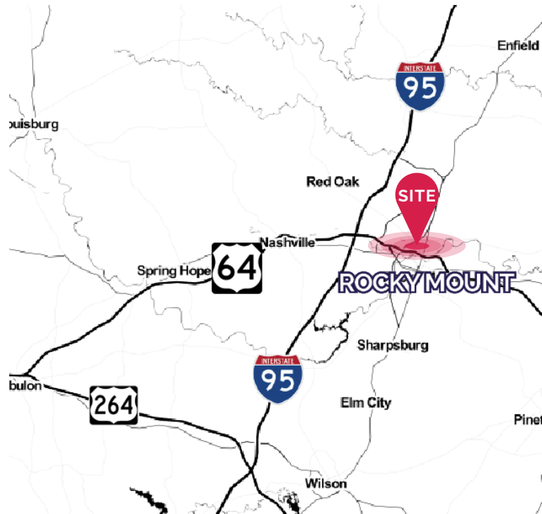
Map tiles by Stamen Design, under CC BY 3.0. Data by OpenStreetMap, under ODbL