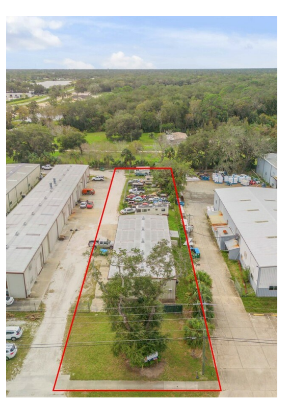
708 W Park Ave 708 W Park Ave, Edgewater, FL 32132