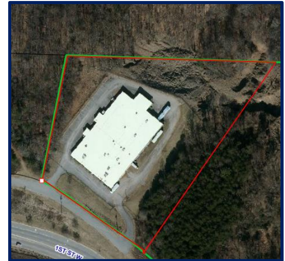
1014 1 st St W Conover