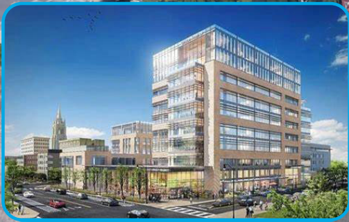
Liberty East & Whole Foods