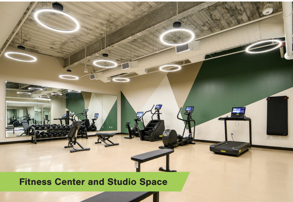
Fitness Center and Studio Space