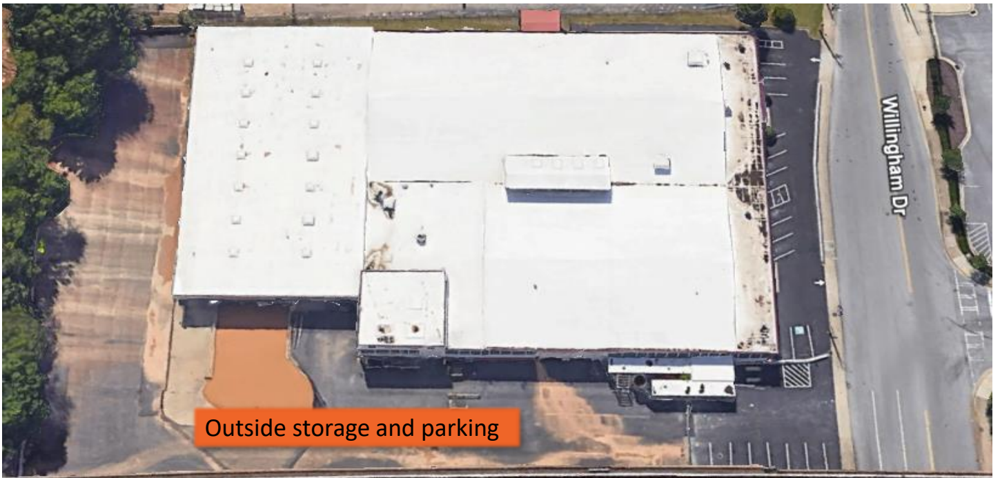
Outside storage and parking