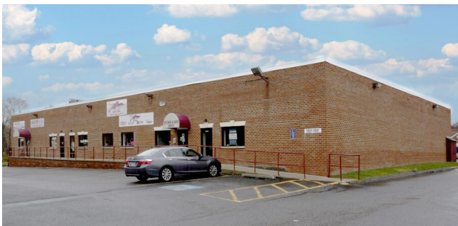
11601 Boiling Brook Place