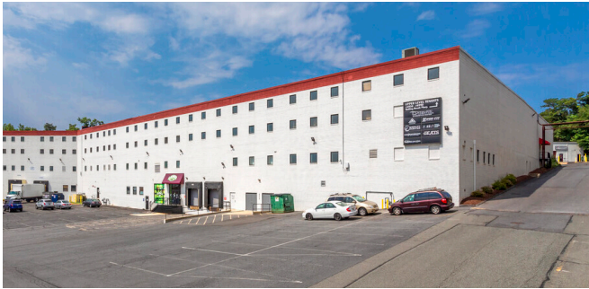
4960 & 4966 Boiling Brook Parkway