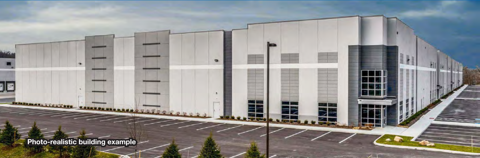
Photo-realistic building example