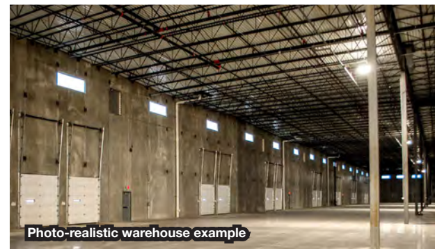
Photo-realistic warehouse example