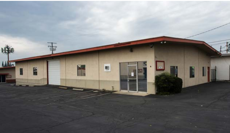
992 W. 9TH STREET