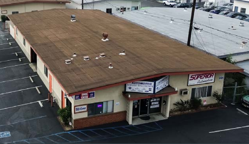
996 W. 9TH STREET