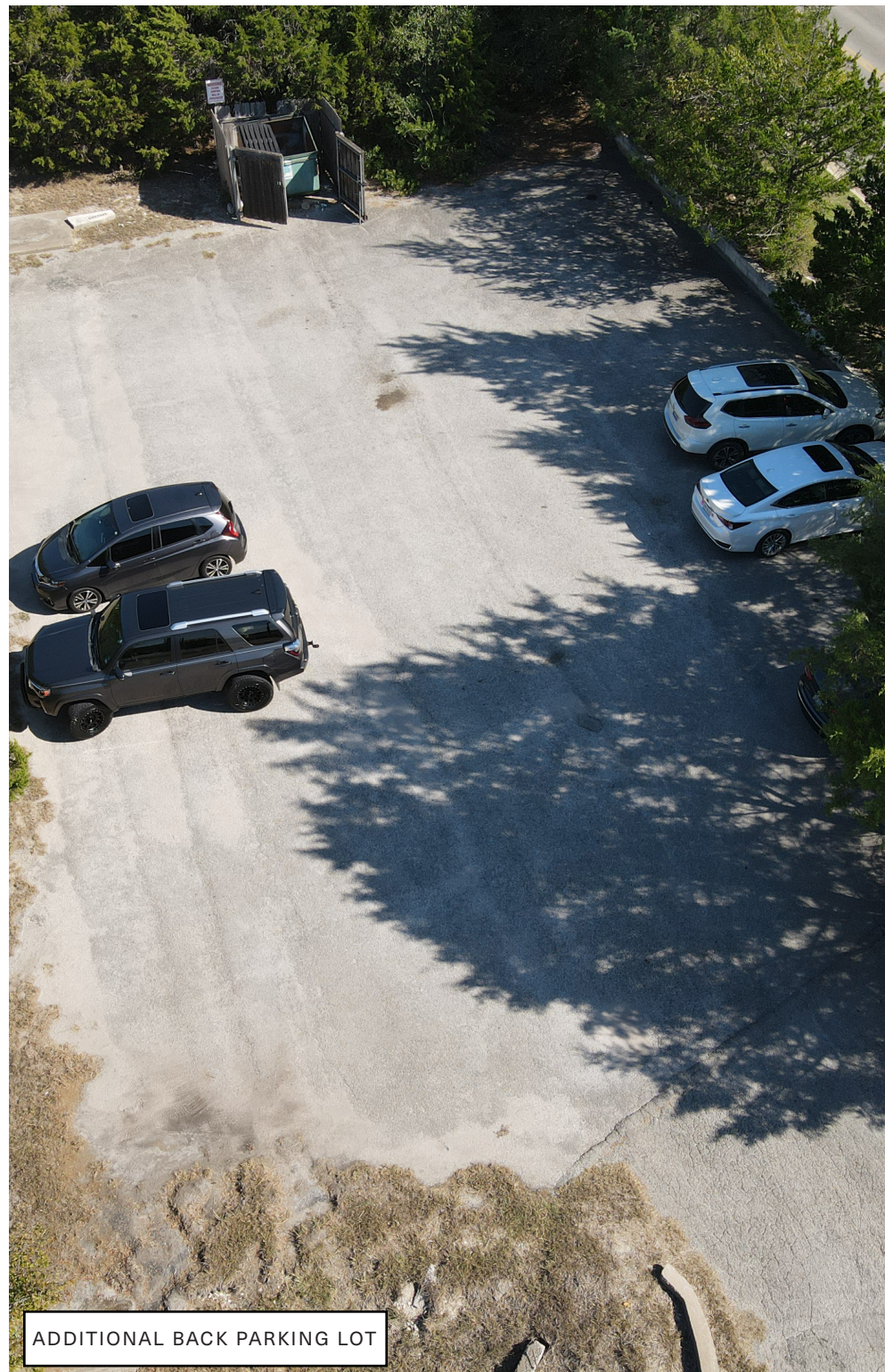
ADDITIONAL BACK PARKING LOT