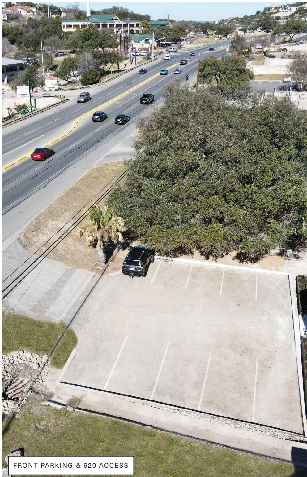
FRONT PARKING & 620 ACCESS