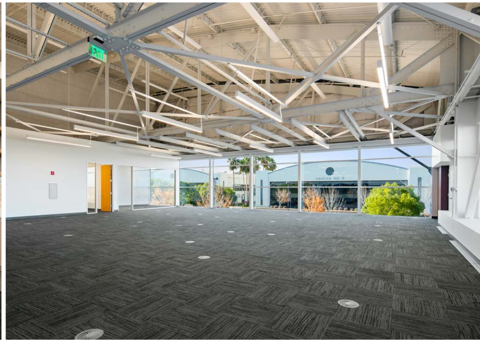
SPEC SUITE 240 ±5,995 RSF