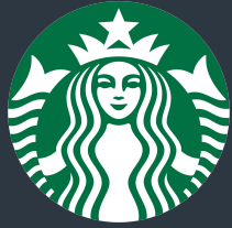
Starbucks 910 Manhattan Avenue