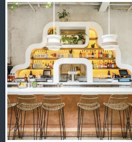
Oxomoco 128 Greenpoint Avenue