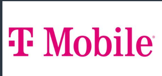
T Mobile 771 Manhattan Avenue