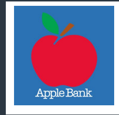
Apple Bank 776 Manhattan Avenue