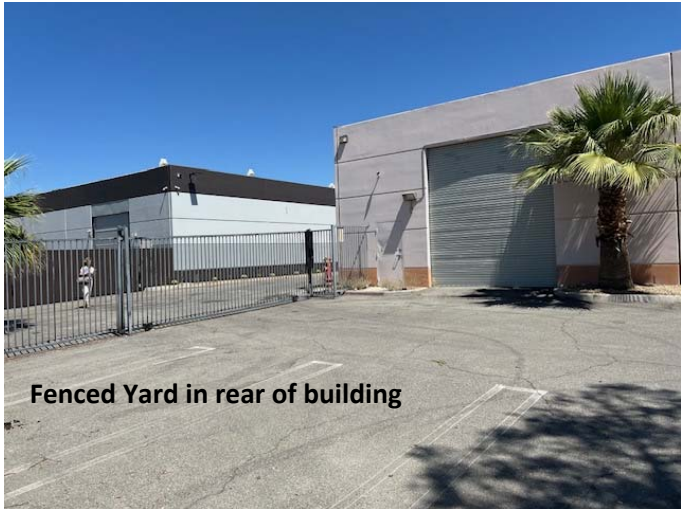
Fenced Yard in rear of building