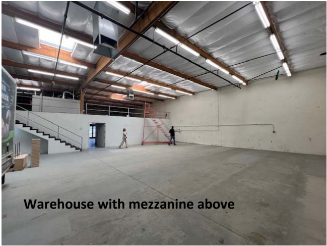
Warehouse with mezzanine above