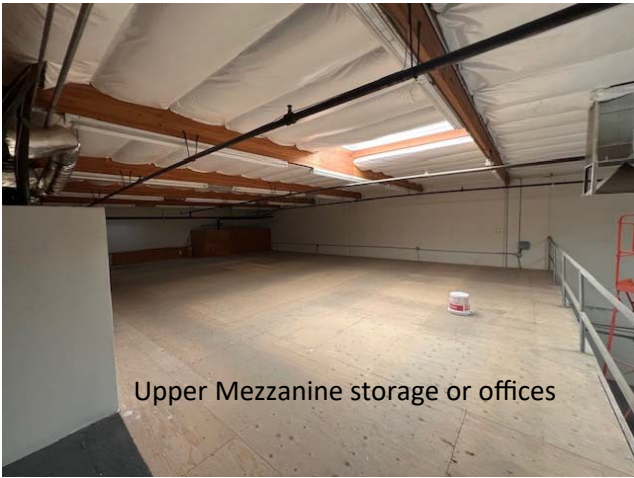
Upper Mezzanine storage or offices