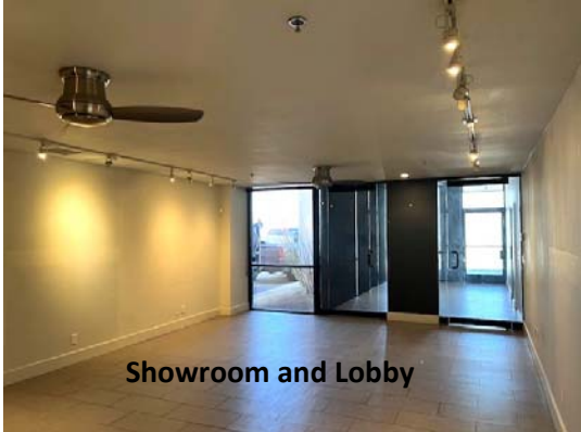
Showroom and Lobby