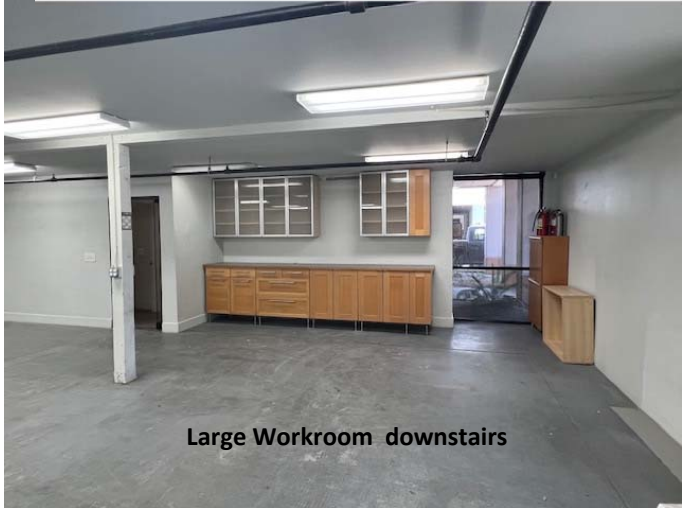
Large Workroom downstairs