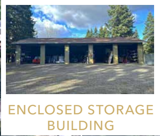
ENCLOSED STORAGE BUILDING