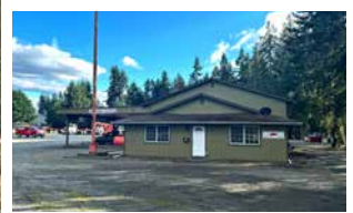
SHOP & OFFICE BUILDING