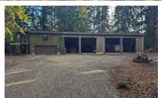
OPEN VEHICLE STORAGE BUILDING