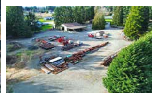
FENCED CONTRACTOR YARD