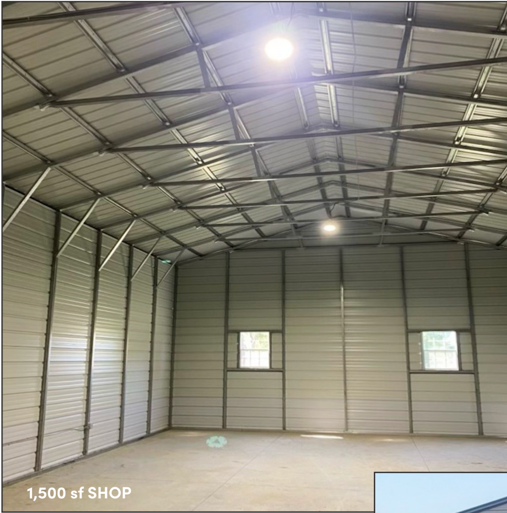
1,500 sf SHOP