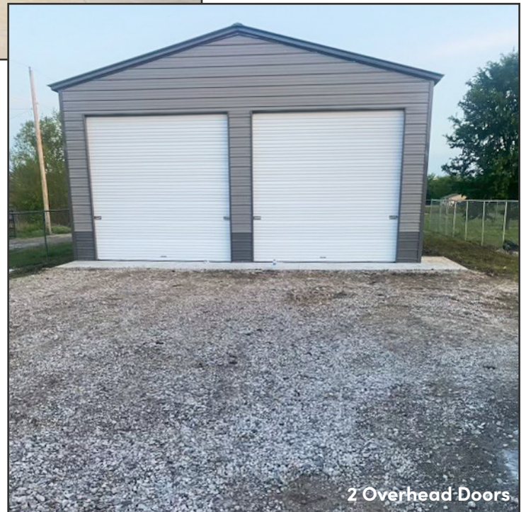
2 Overhead Doors