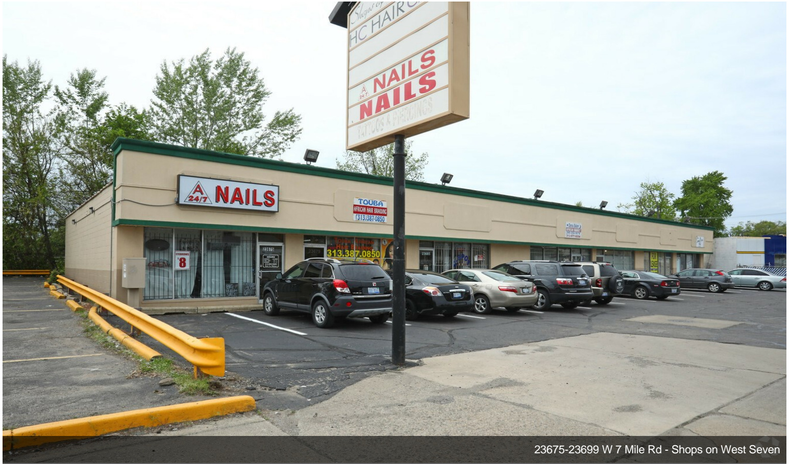
23675-23699 W 7 Mile Rd - Shops on West Seven