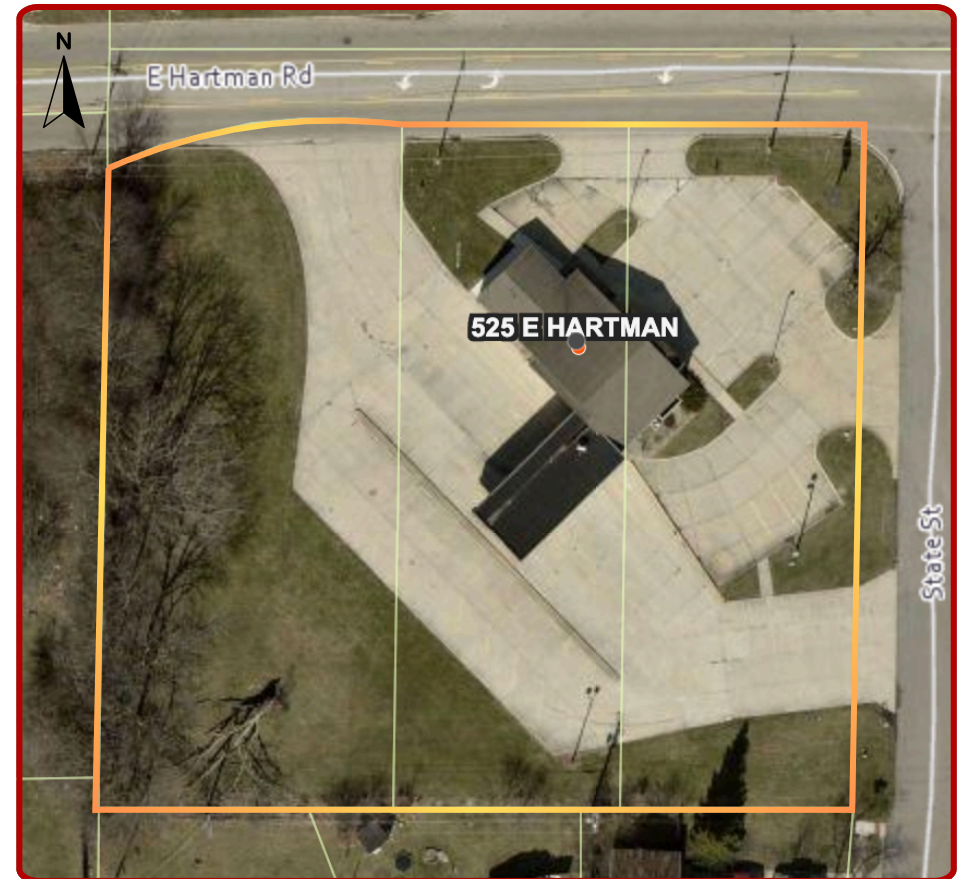
Aerial View with Property Boundary