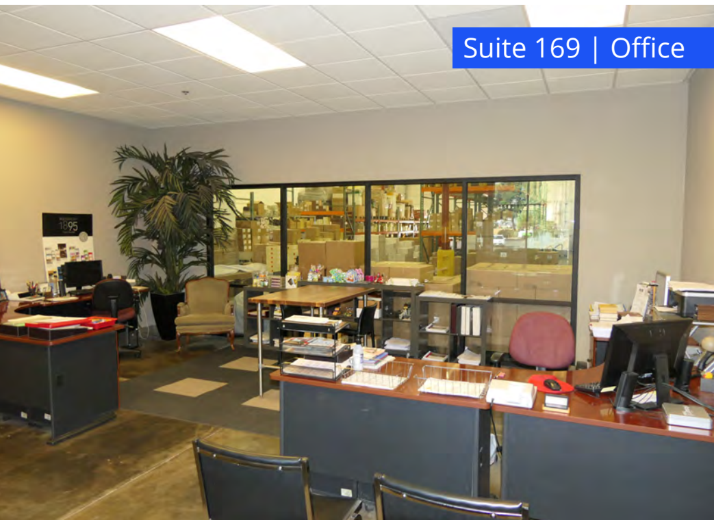
Suite 169 | Office