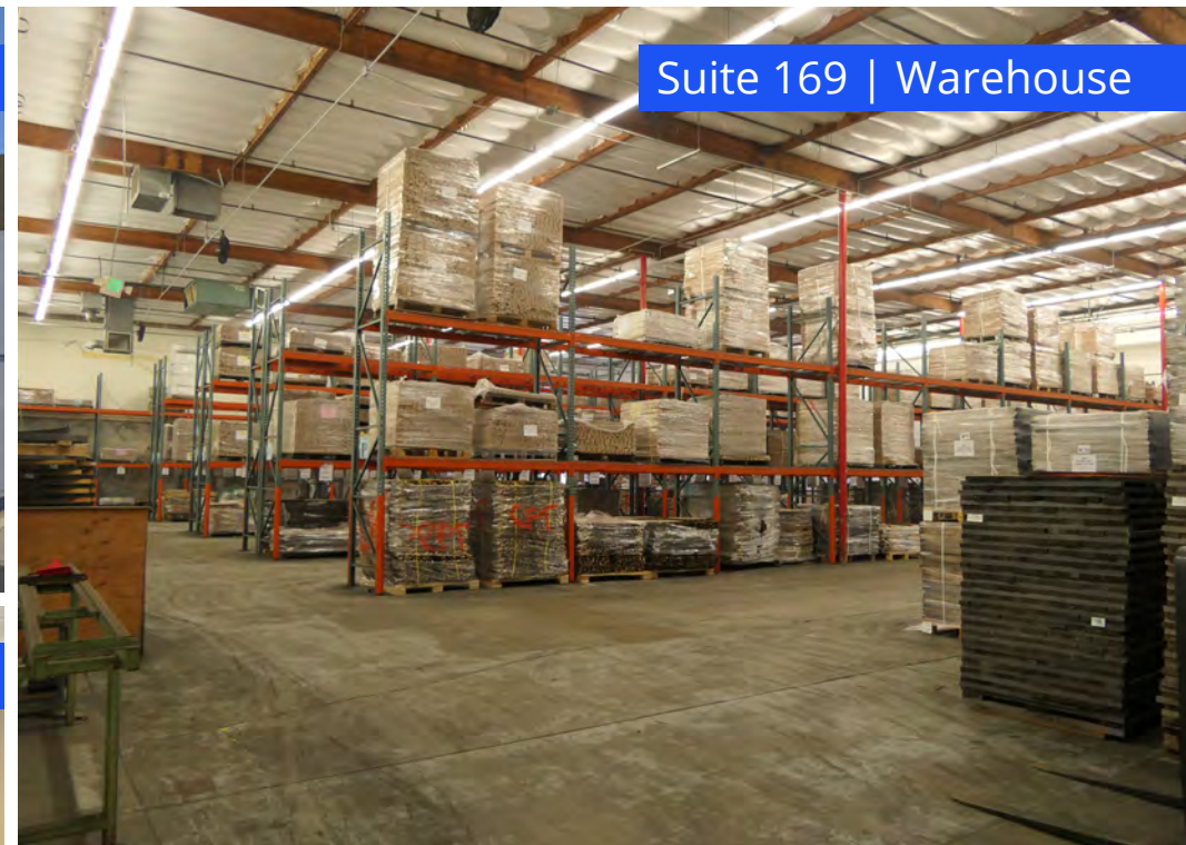
Suite 169 | Warehouse