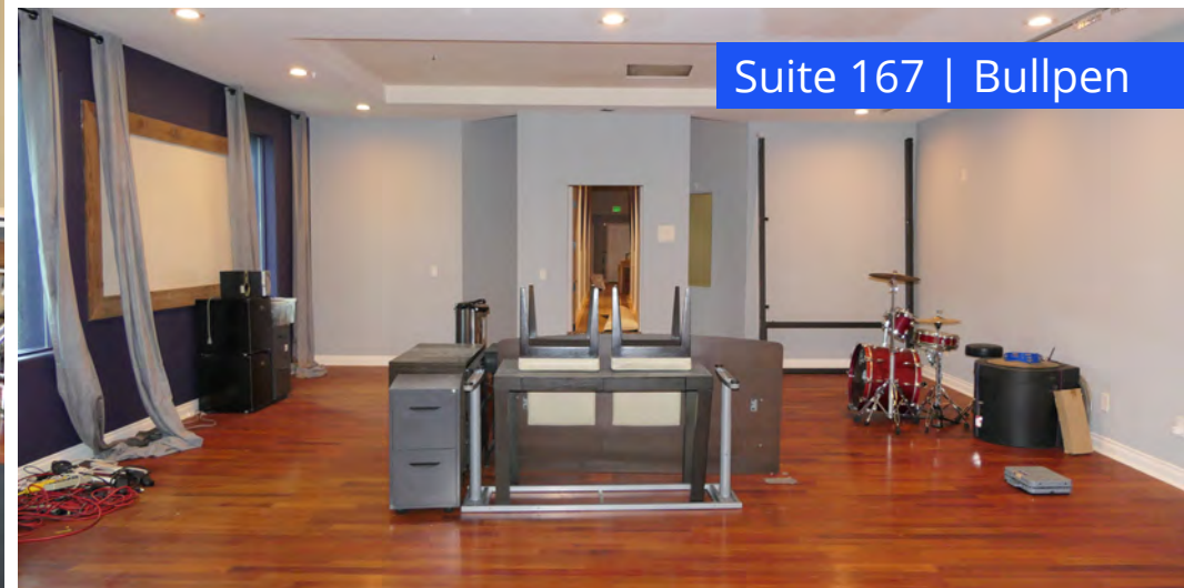
Suite 167 | Bullpen