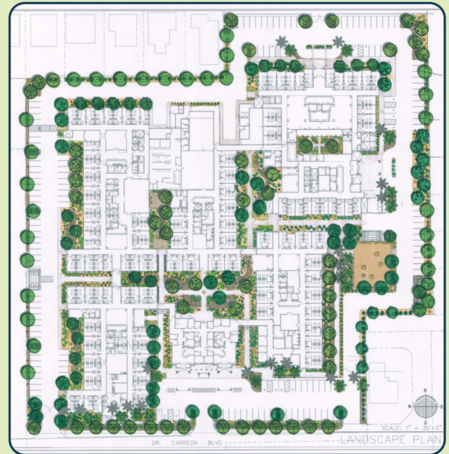
Site Plan for Previously State approved Skilled Nursing Facility for 287 beds