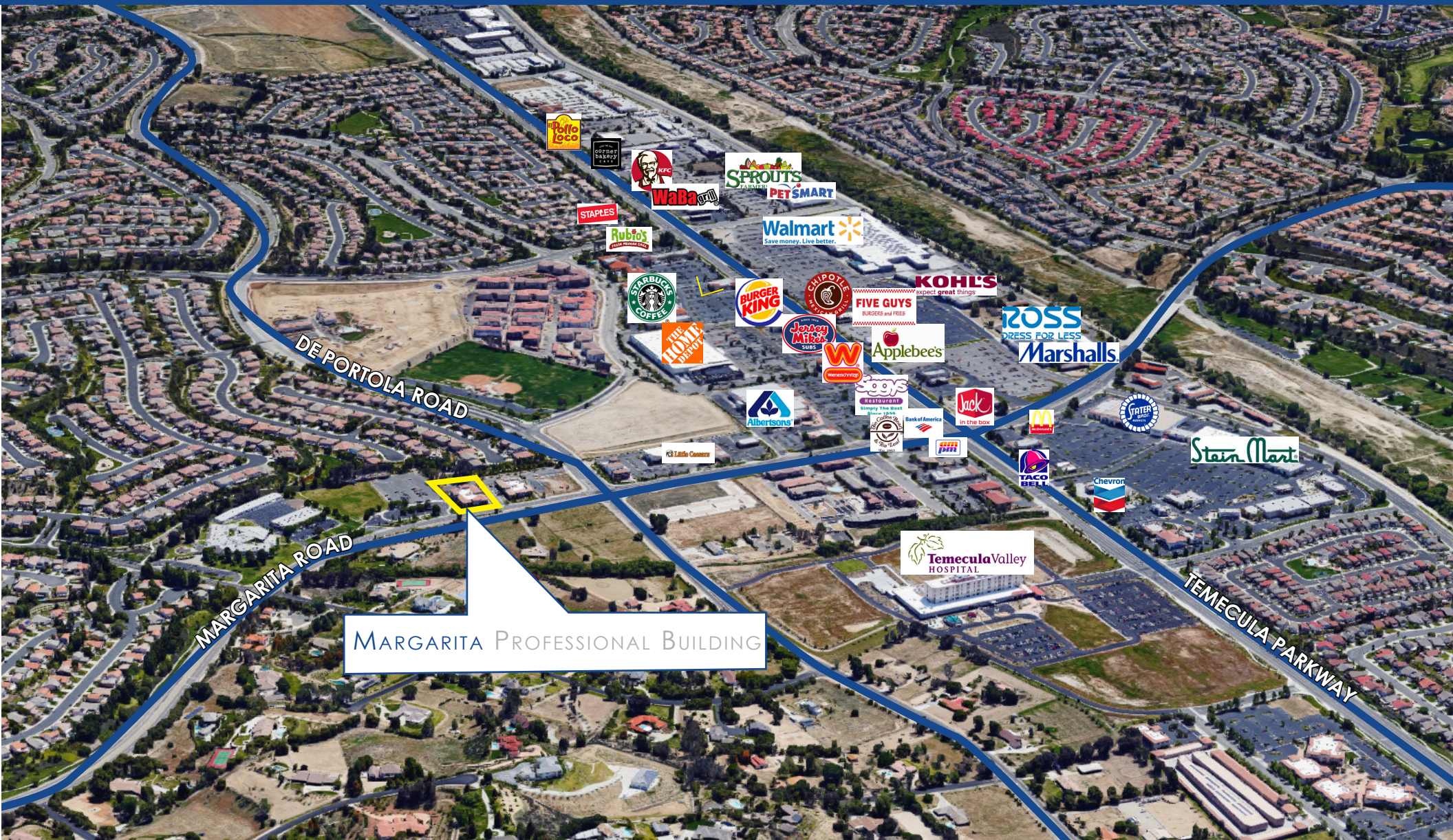
MARGARITA PROFESSIONAL BUILDING

43920 MARGARITA ROAD | TEMECULA | CALIFORNIA | 92592