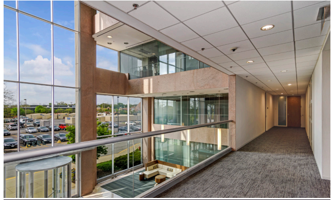
Newly updated corridors & common areas