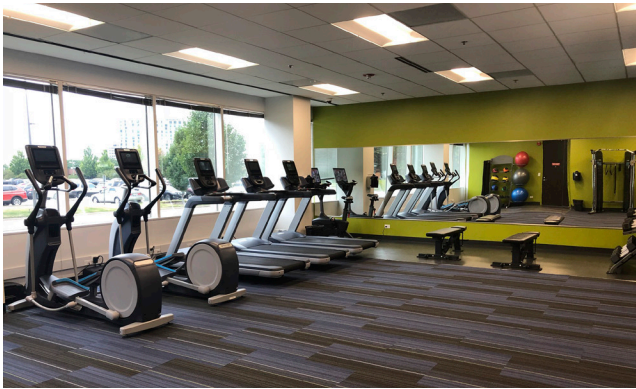
24-hour fitness center equipped with private locker room and shower facilities