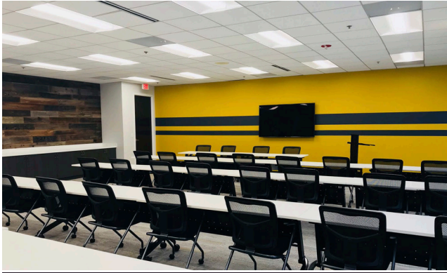
50-person, state-of-the-art conferencing facility