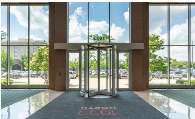
Impressive lobby with 4-story atrium