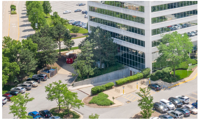
Executive underground reserved parking