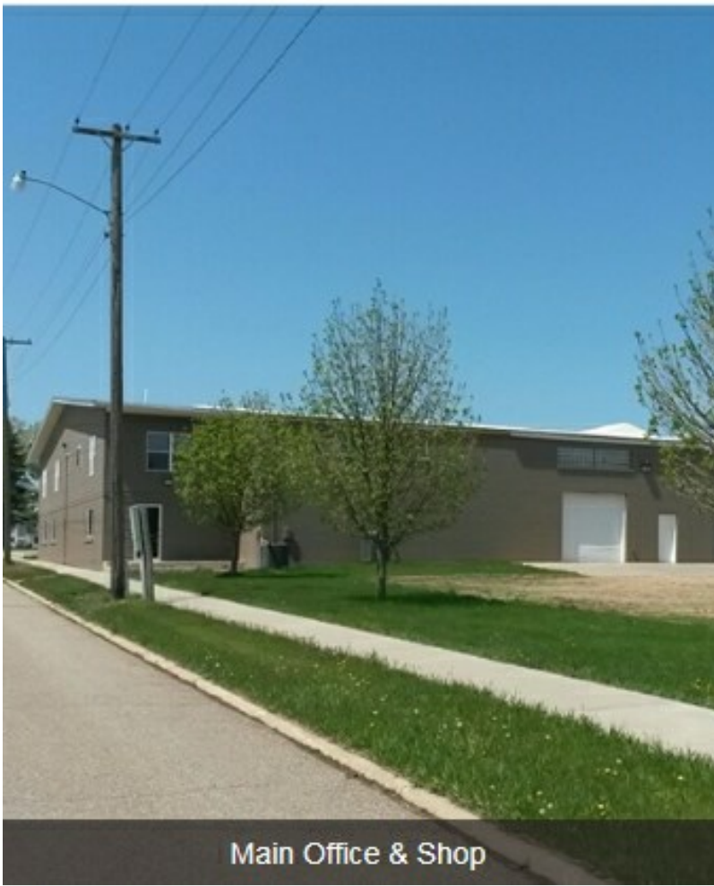
Main Office & Shop