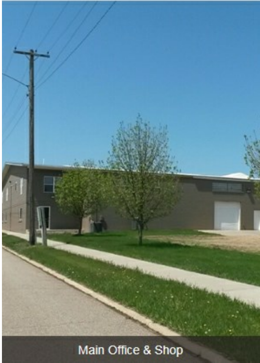
Main Office & Shop