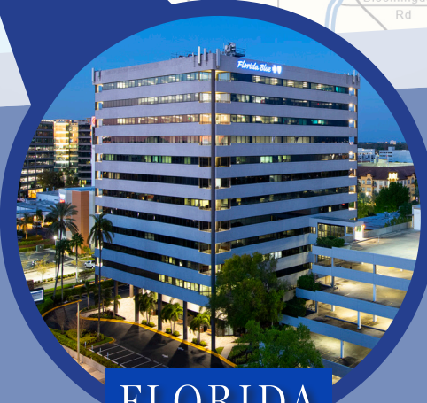
FLORIDA BLUE TOWER