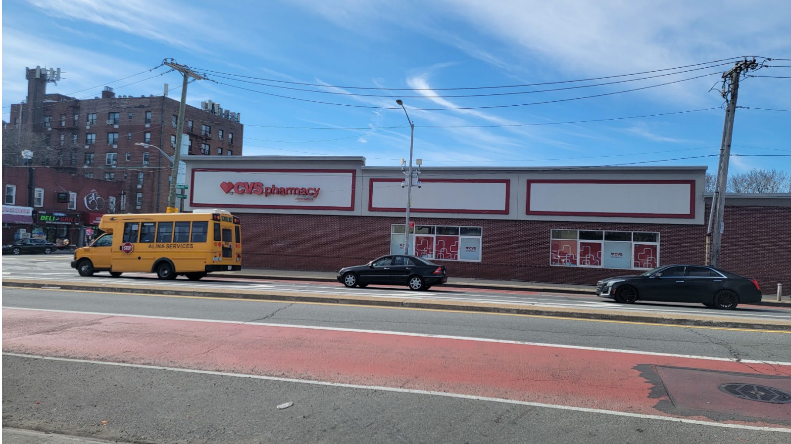
Pharmacy Seconds Away