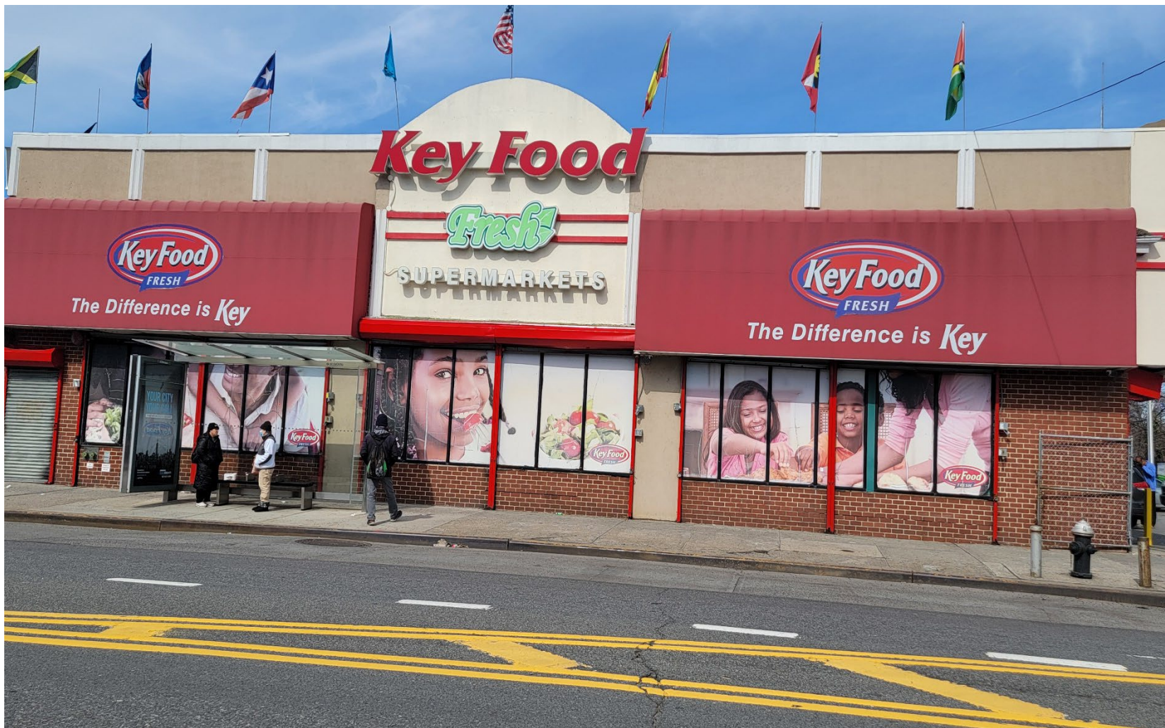
Major Grocery Store Seconds Away