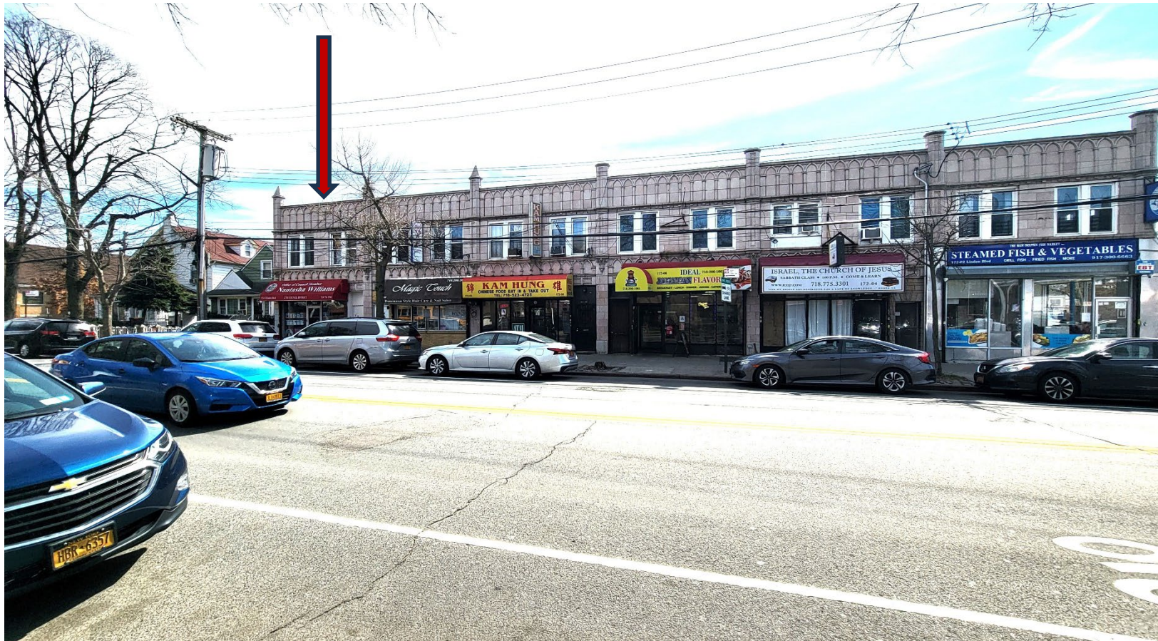
172-12 Linden Blvd. – Subject Part of Very Prosperous Retail Center.