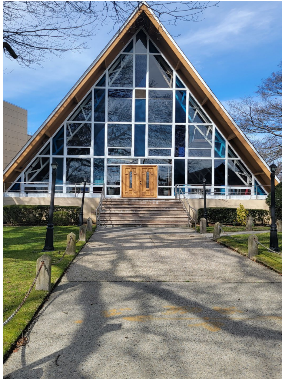
St. Albans Church accosts Street