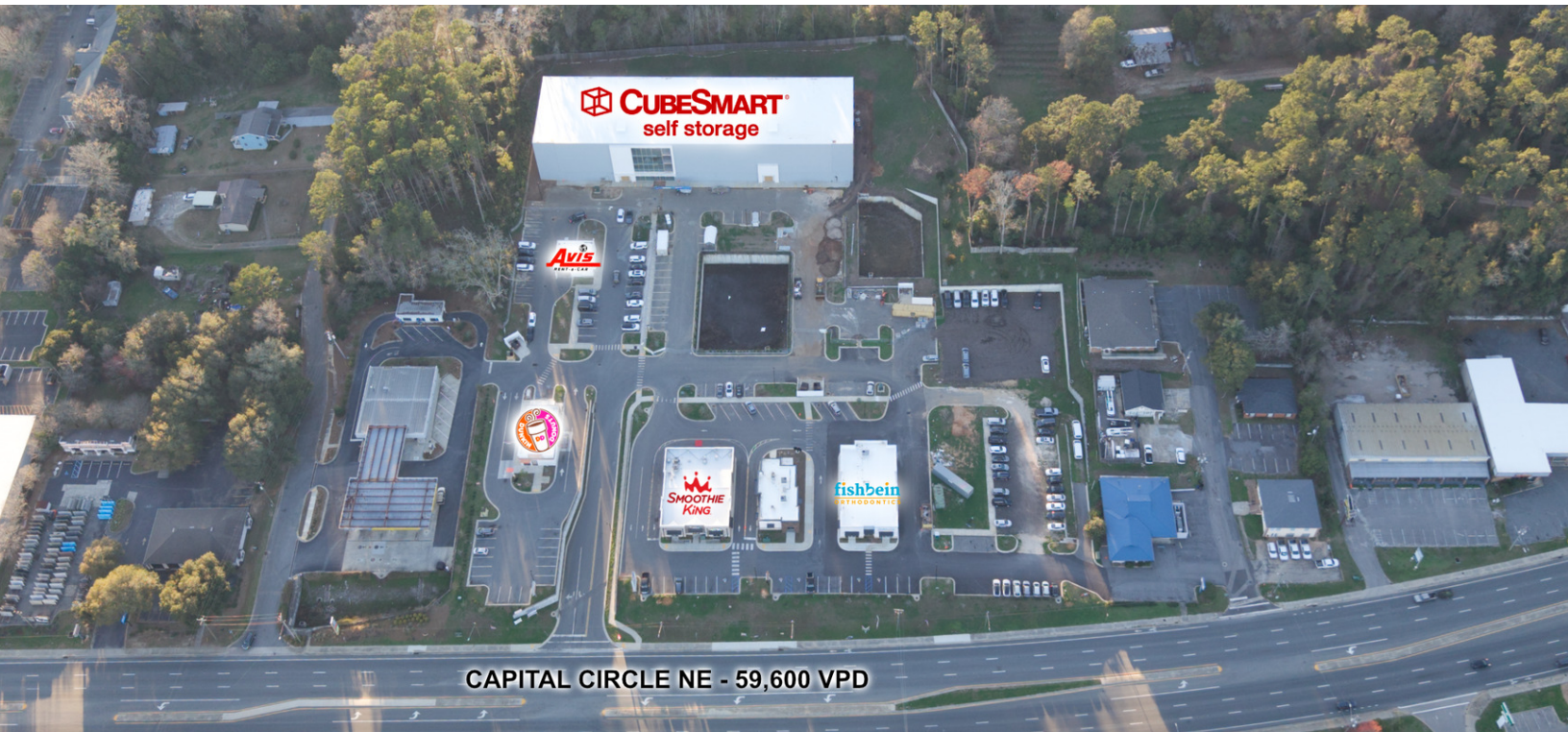
CAPITAL CIRCLE NE - 59,600 VPD