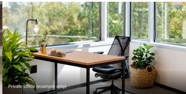
Private office (example only)