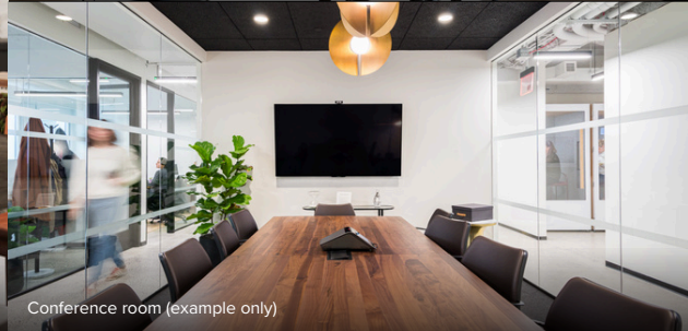
Conference room (example only)