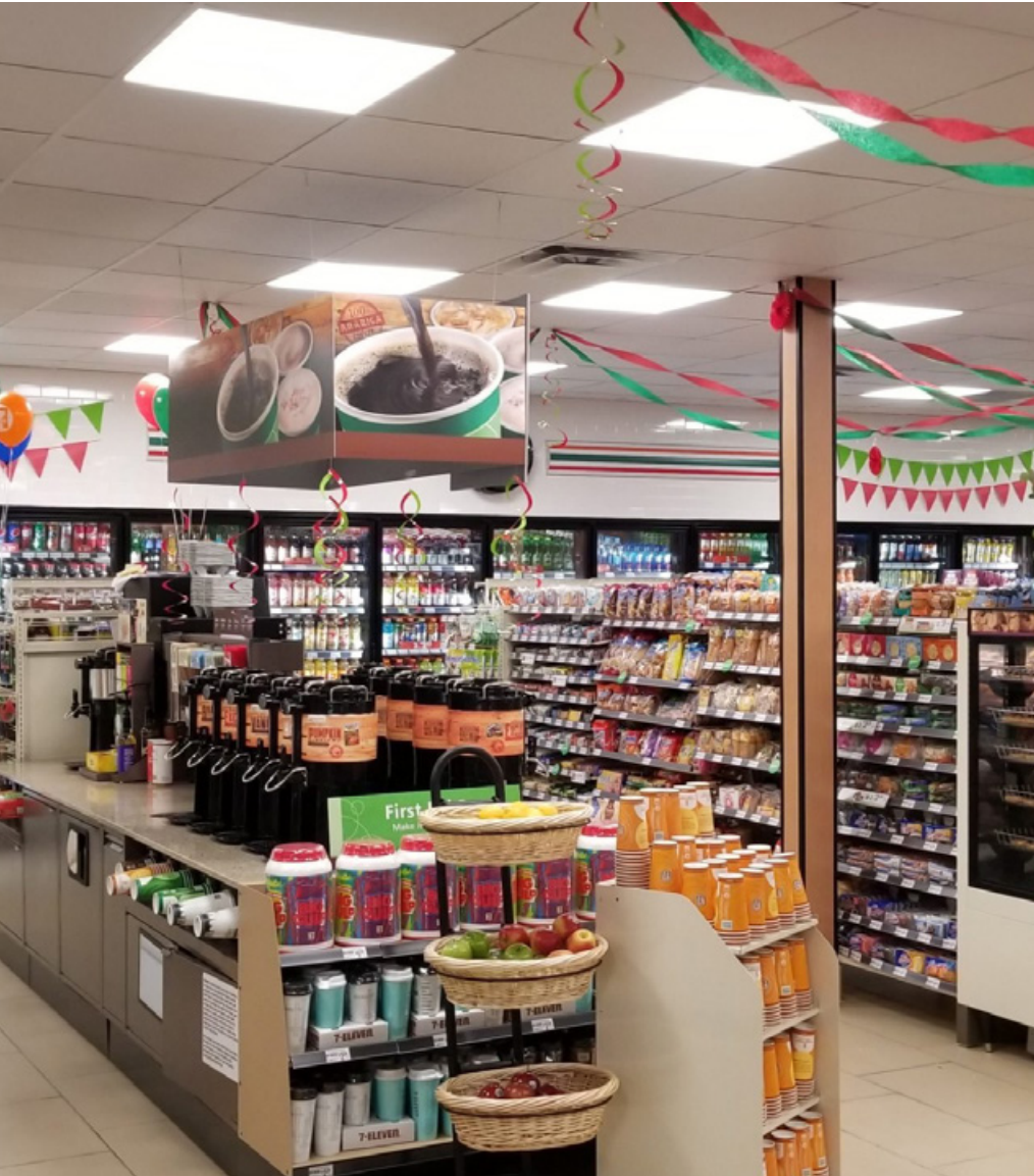
7-Eleven, Inc. Acquired Sunoco, LP in a Transaction That Finalized January 2018 of Approximately 1,108 Stores Across 18 States