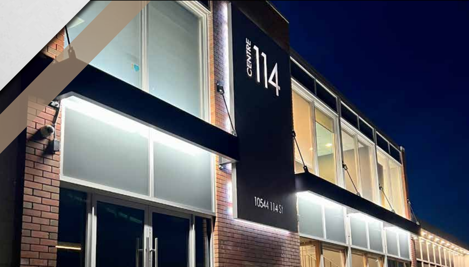
NEW FLOORING & FACADE