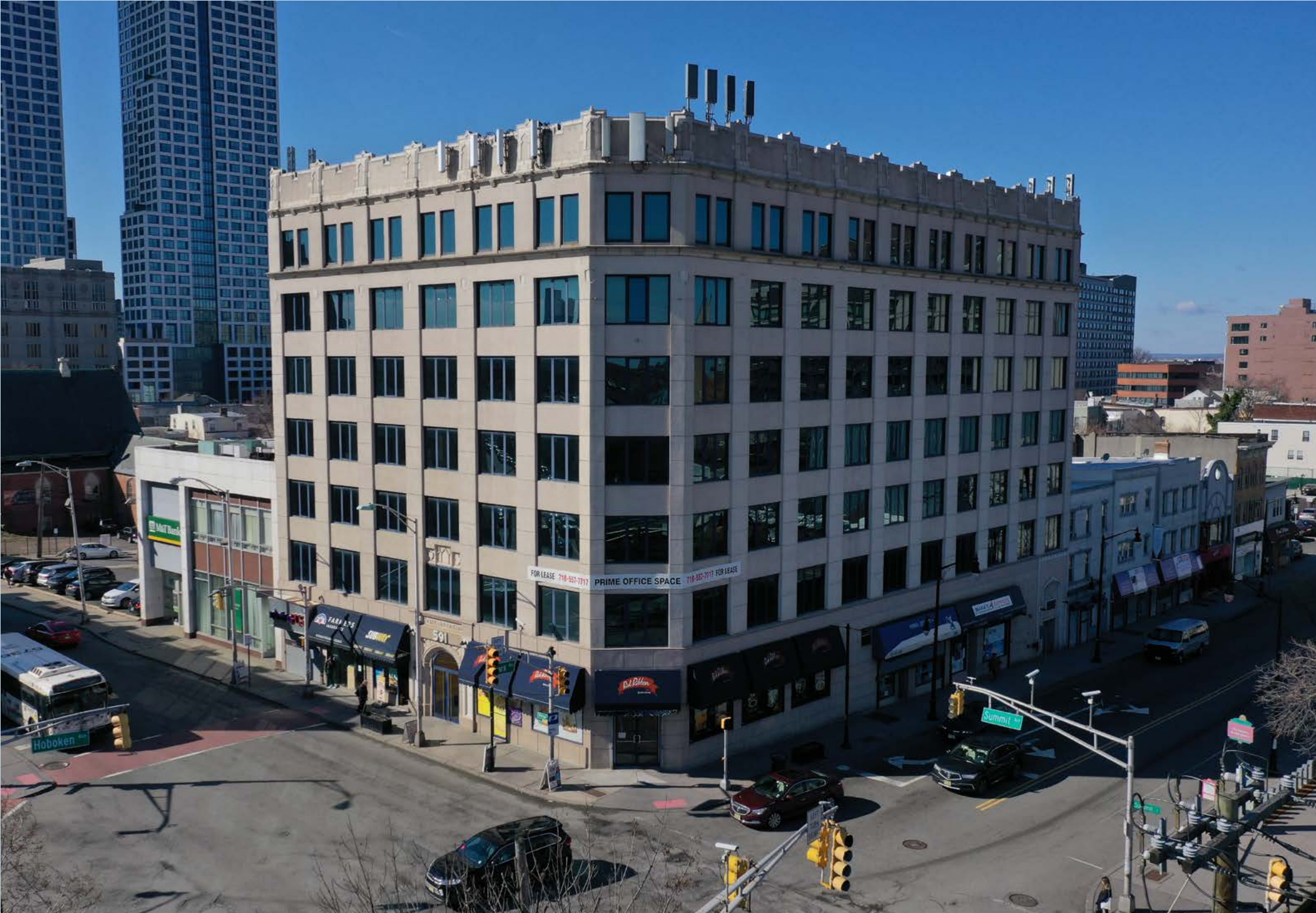
591 SUMMIT AVE JERSEY CITY, NJ 07306