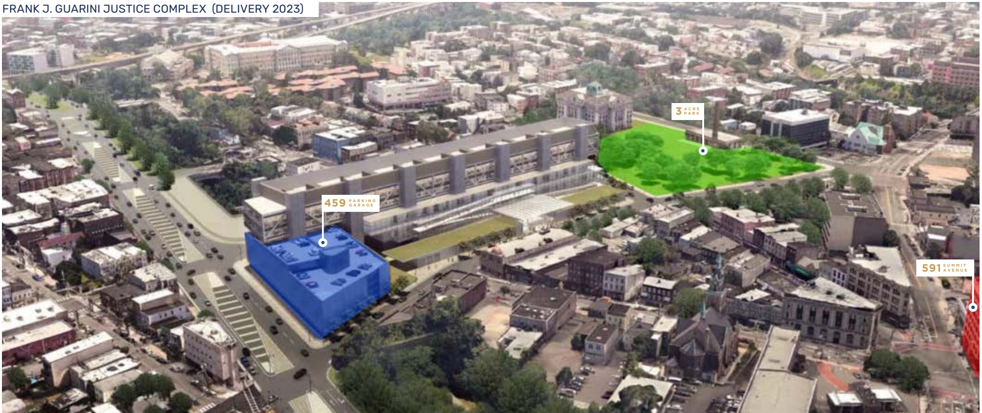
24 COURT ROOMS & ADMINISTRATIVE OFFICES