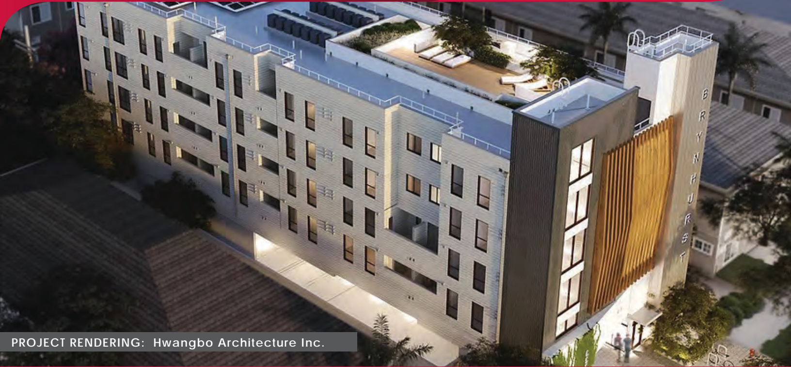
PROJECT RENDERING: Hwangbo Architecture Inc.