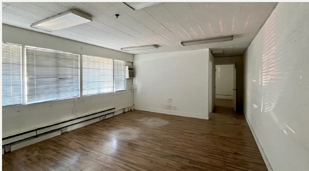
⬆ Front Office Space