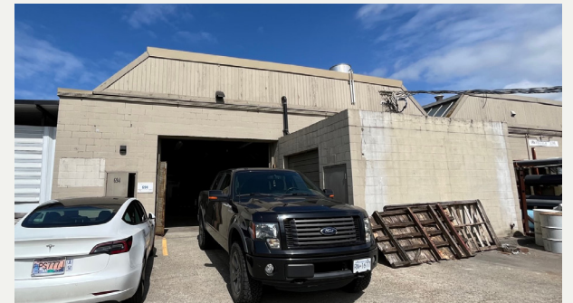
⬆ Rear Loading Bay & Covered Storage