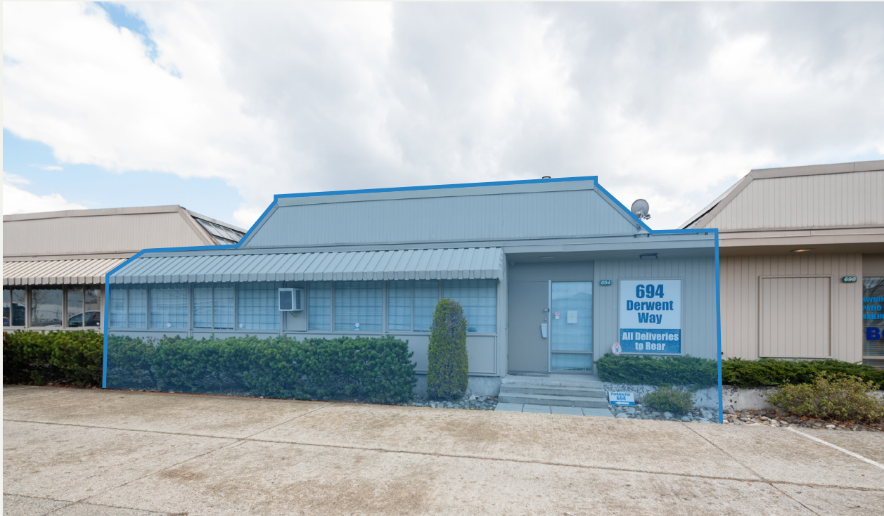
⬆ Front Entrance

6,878 sq. ft. office and warehouse space.