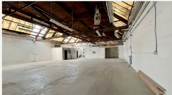
⬆ Warehouse Area