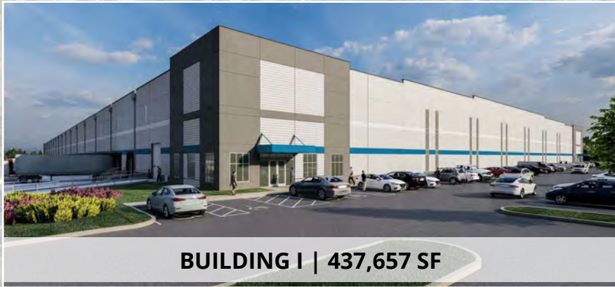
BUILDING I | 437,657 SF