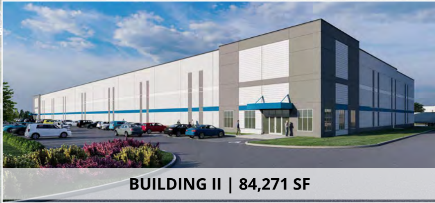
BUILDING II | 84,271 SF